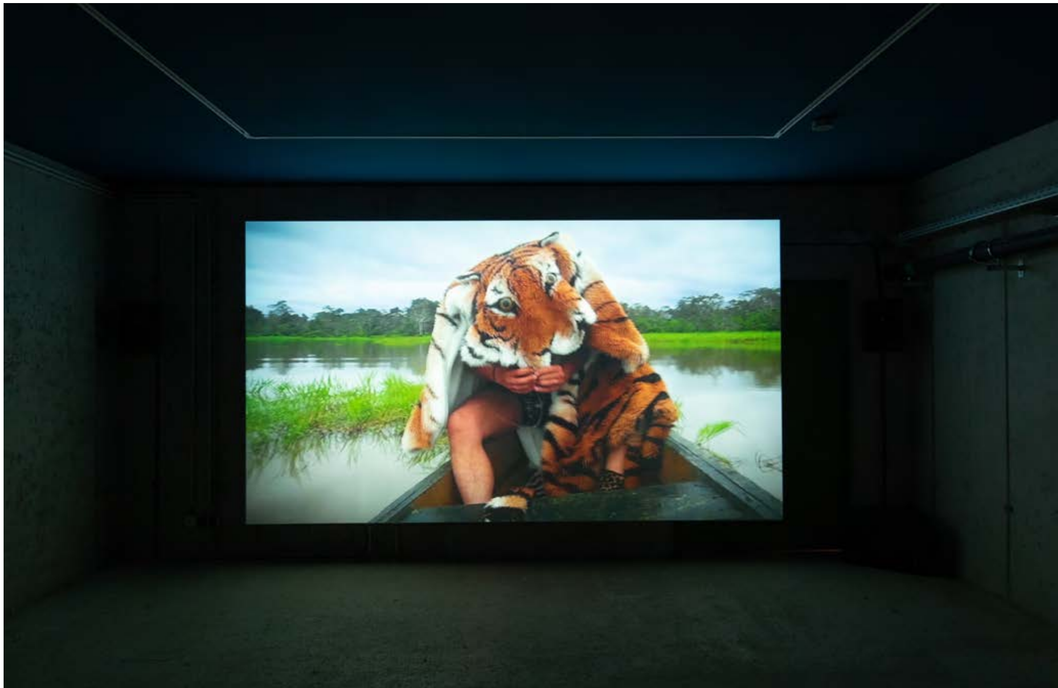
Identidad Perdida, 2023, exhibition view: Between Bridges, Berlin; 2023