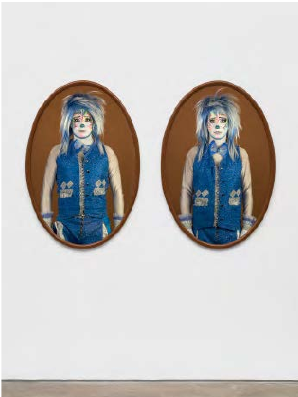
Identidad Payasa: D Charles Morrison, 2017, 2 Inkjet Prints mounted on MDF, framed, 113 x 79 cm