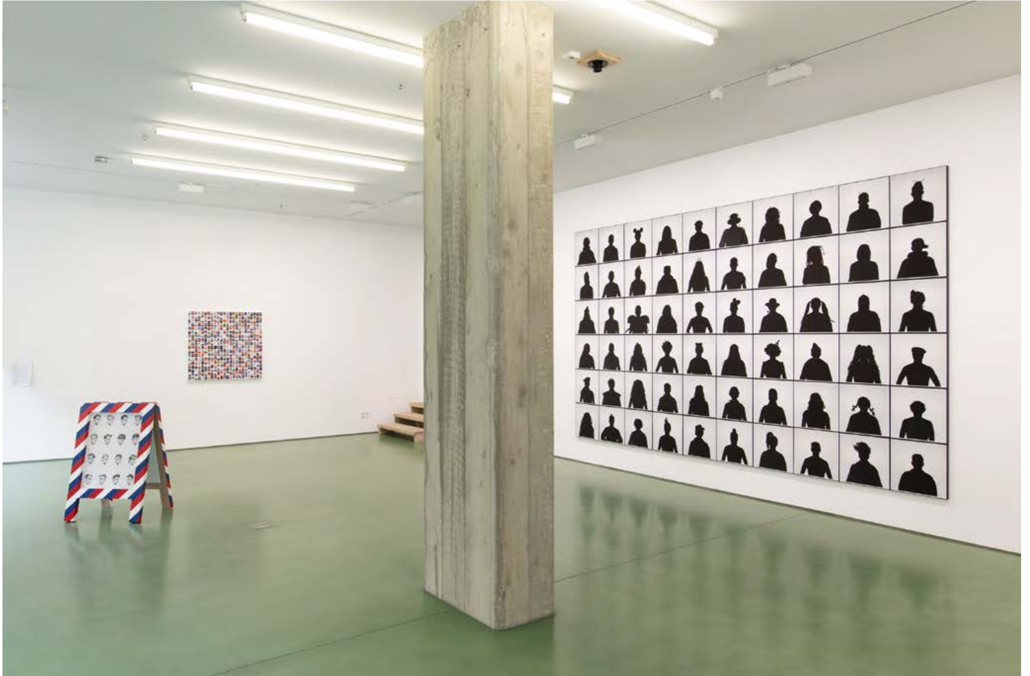
Identidad Perdida, 2023, exhibition view: Between Bridges, Berlin; 2023