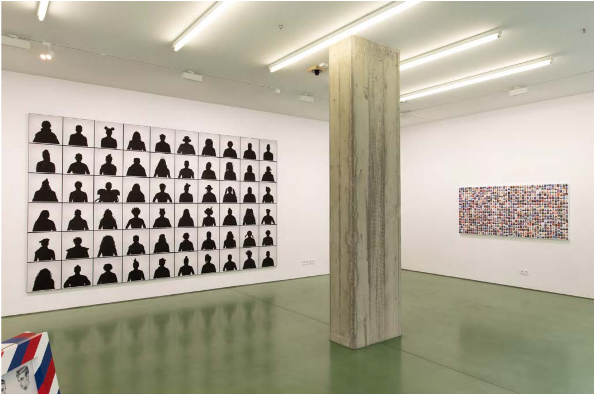
Identidad Perdida, 2023, exhibition view: Between Bridges, Berlin; 2023