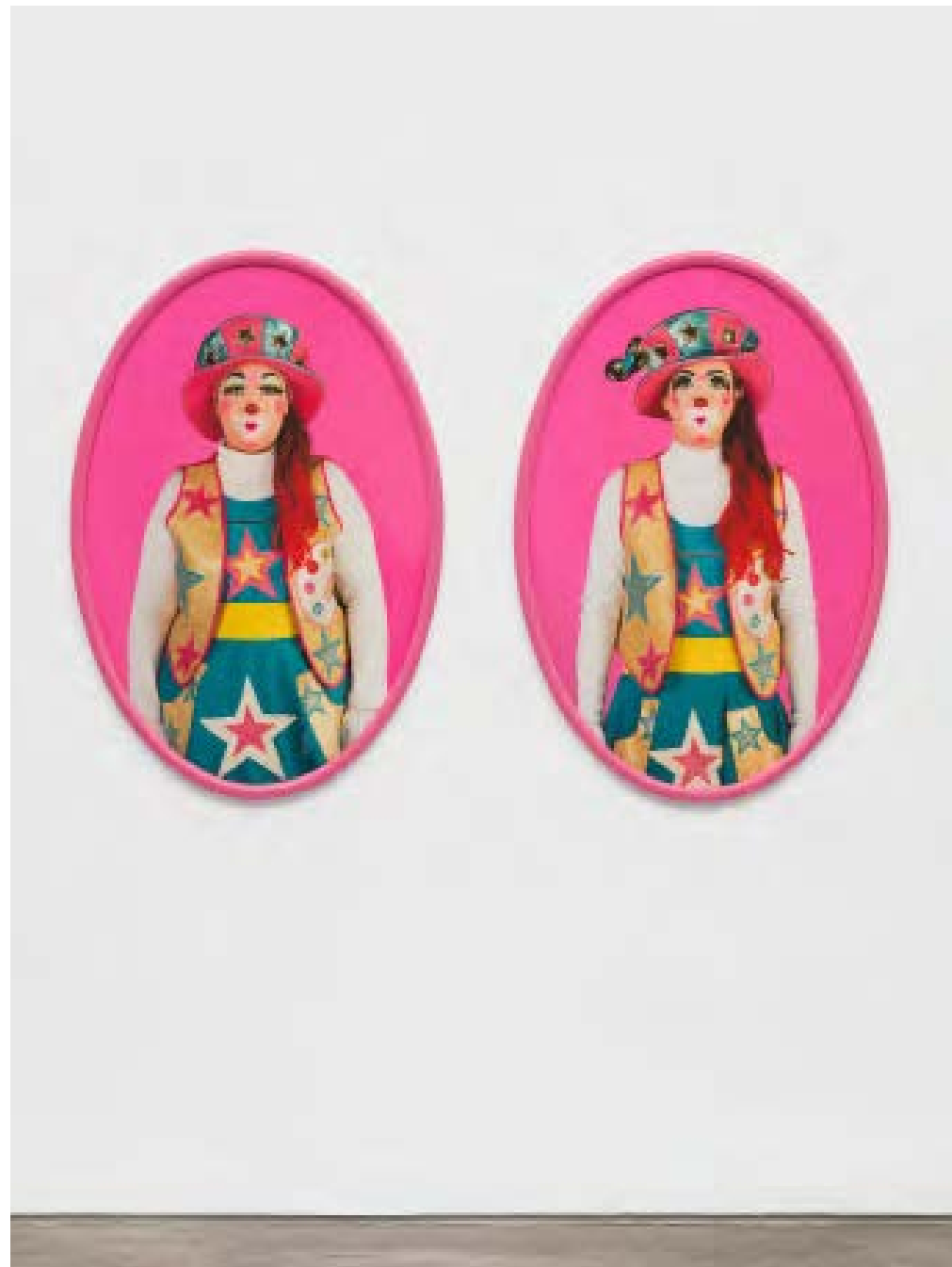
Identidad Payasa: Acuarela, 2017, 2 Inkjet Prints mounted on MDF, framed, 113 x 79 cm