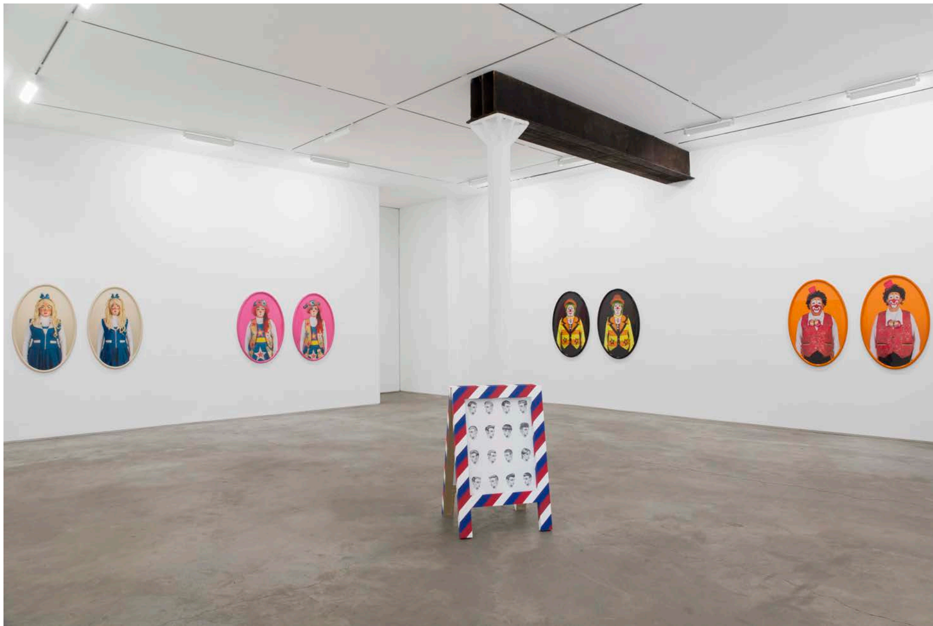
Exhibition View, Identidad Payasa, 2017 [walls], Masculinity, 2006 [center]. Identidad Perdida, 2023, James Fuentes, New York