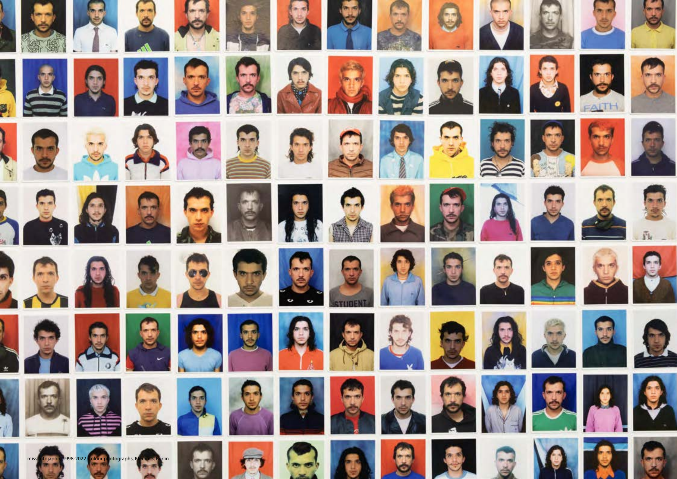
miss fotojapón 1998-2022. colour photographs, Klemm's, Berlin