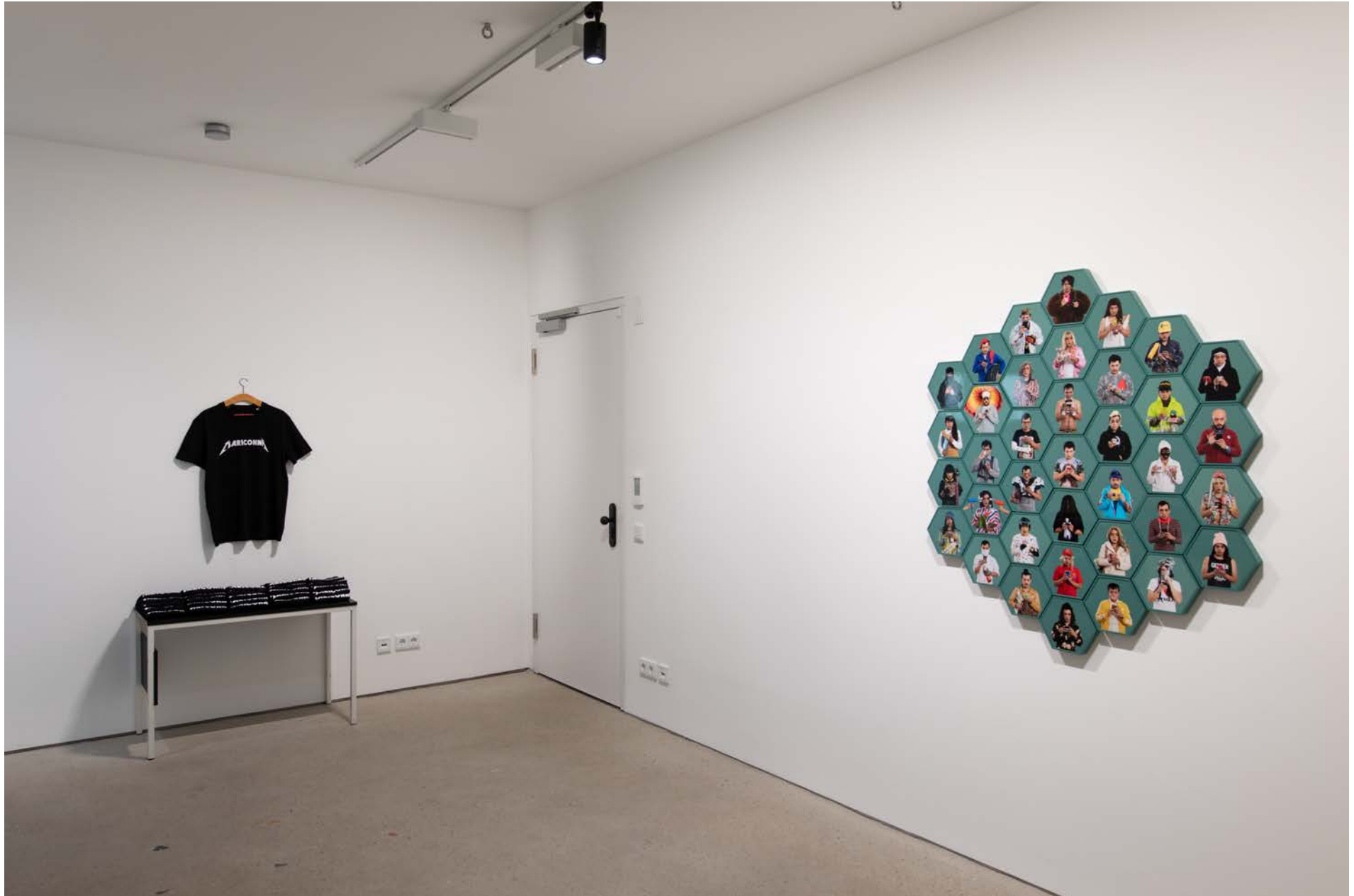
Identidad Perdida, 2023, exhibition view: Between Bridges, Berlin; 2023