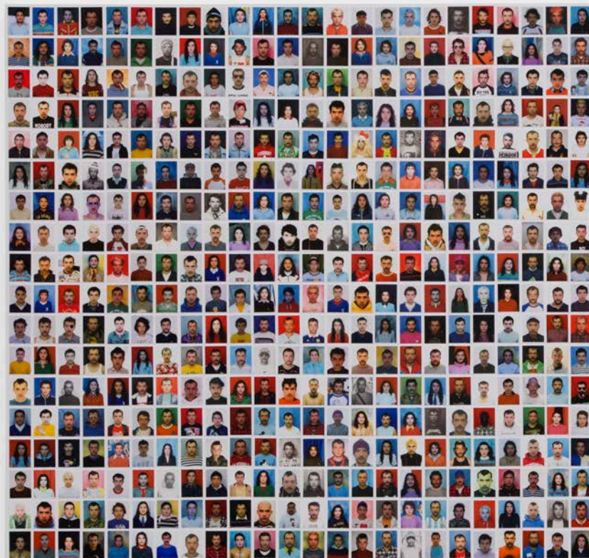
miss fotojapón, 1998-2022, Inkjet Prints mounted on MDF box frame, 100 x 100 x 5 cm