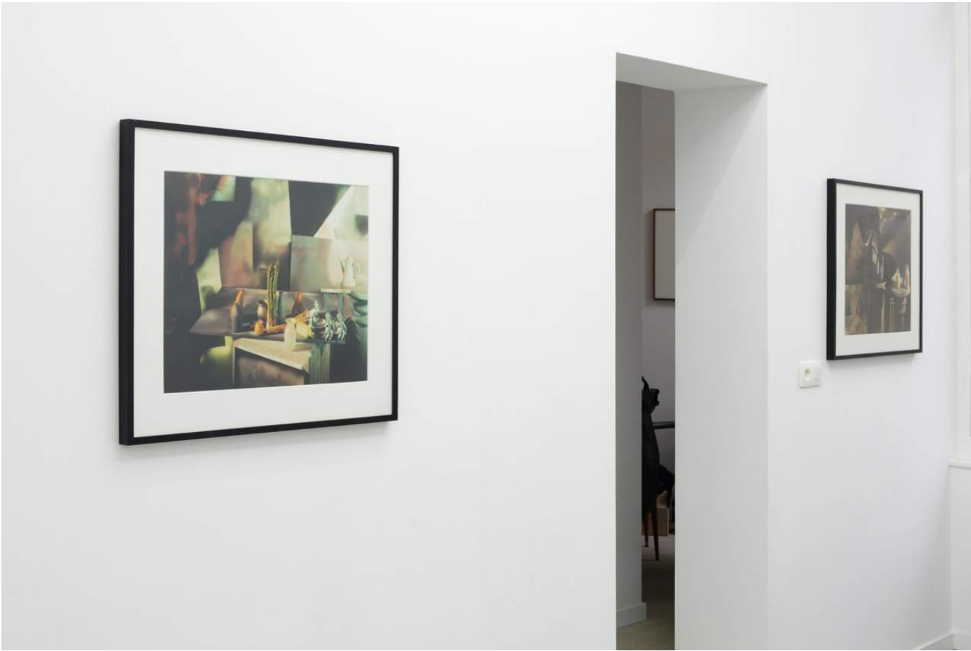
A Knife is A Knife, 2013/2014, installation view at Super Dakota, Brussels