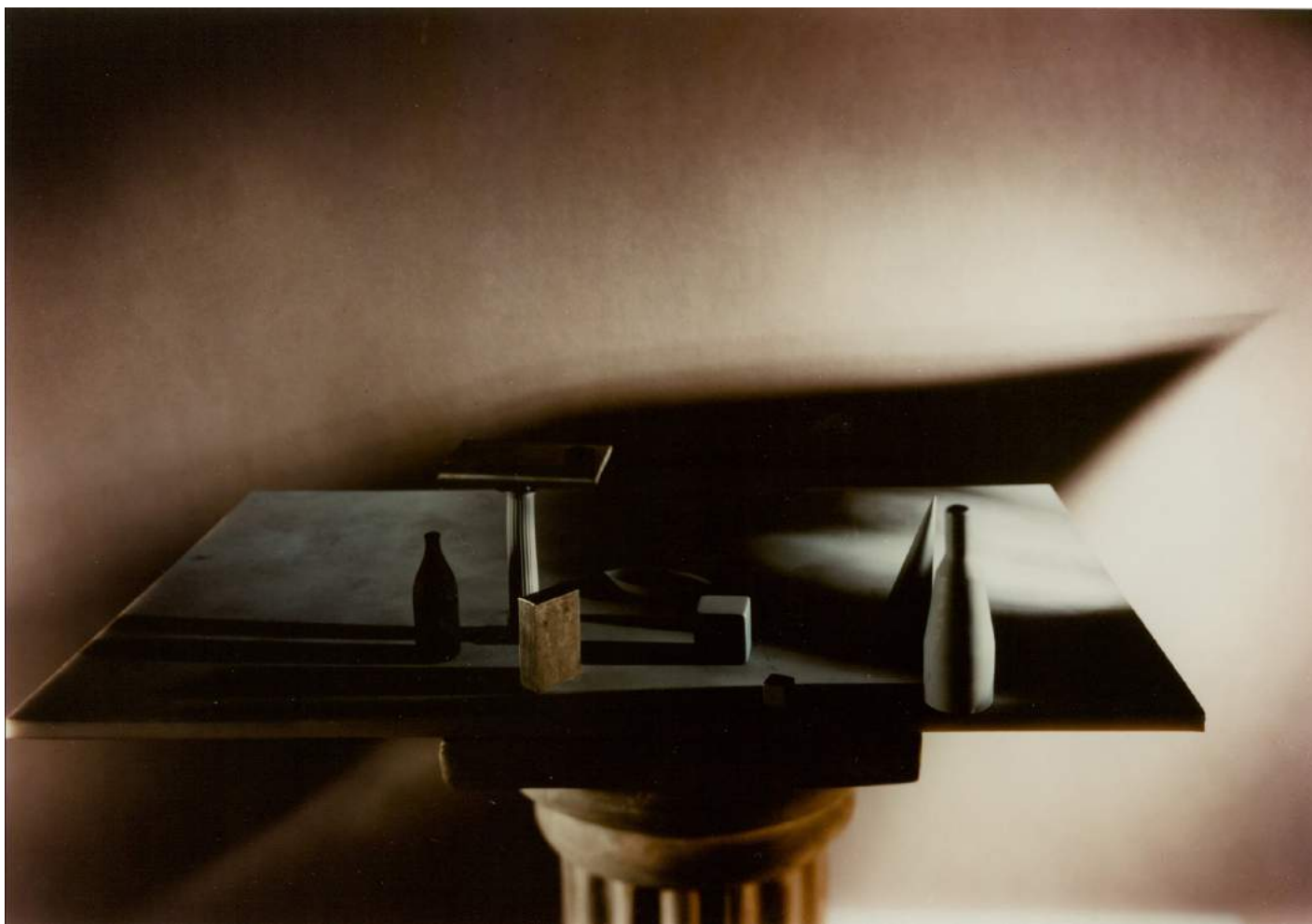
Untitled (E1065), 1981, platinum palladium contact print, 20,3 x 25,4 cm