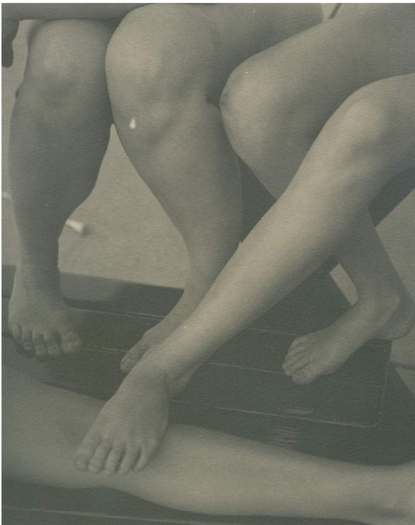
Untitled (E1065), 1981, platinum palladium contact print, 25,4 x 20,3 cm