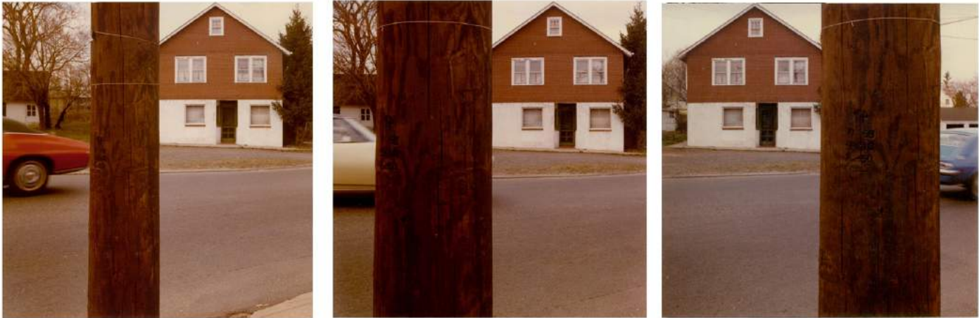
Untitled (127.10.128.1.10), 1975, three chromogenic prints