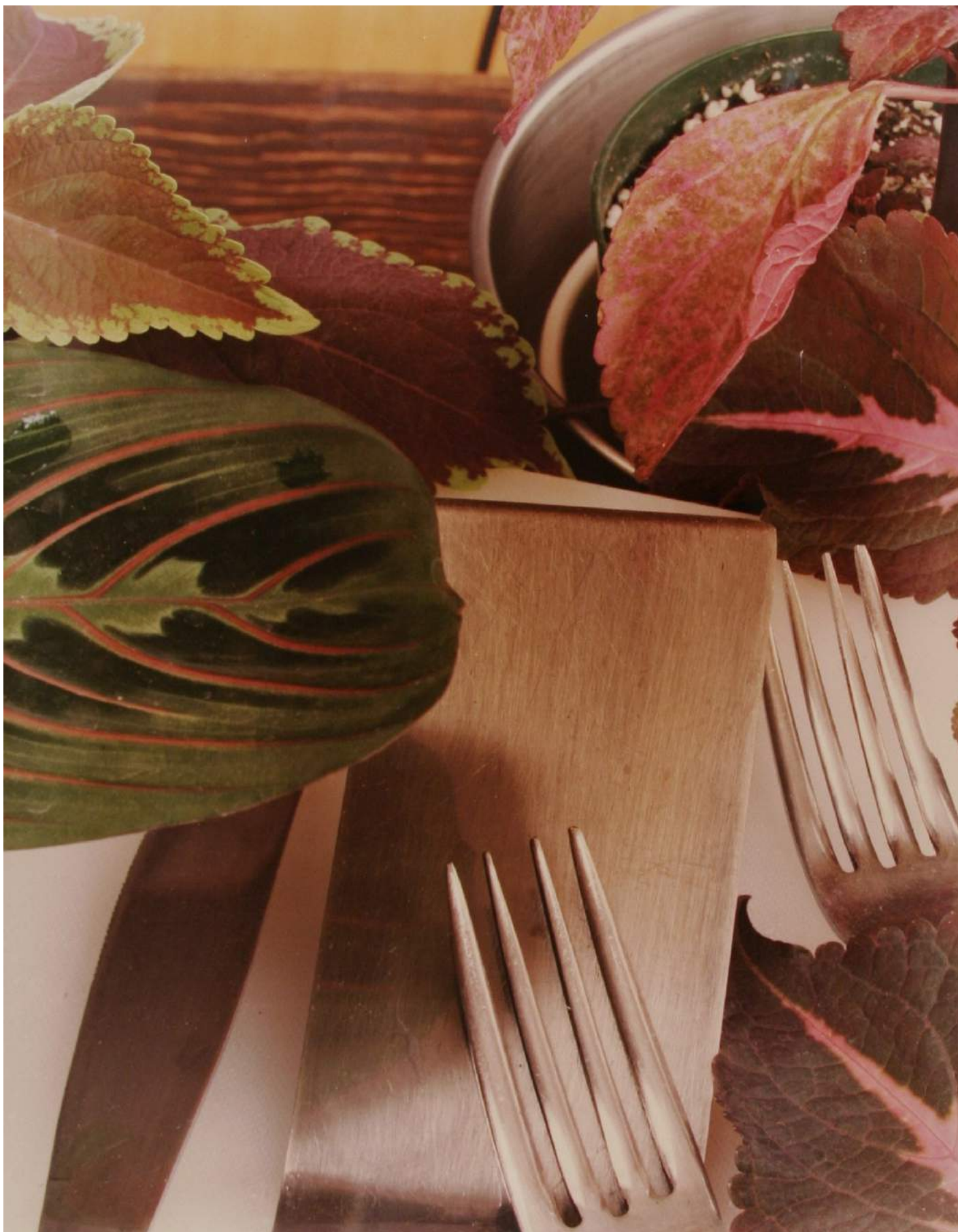
Untitled (KSL 37.4), 1978, chromogenic print, 50,8 x 61 cm