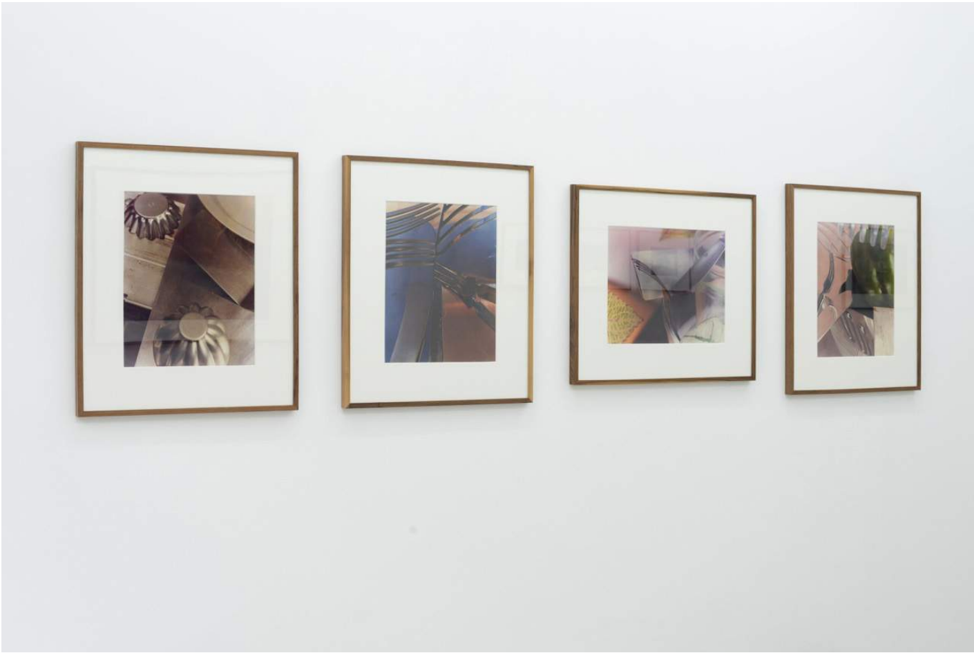
A Knife is A Knife, 2013/2014, installation view at Super Dakota, Brussels