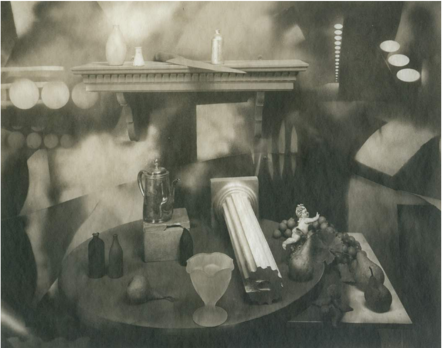
Untitled (1868), 1986, platinum palladium contact print, 20,3 x 25,4 cm