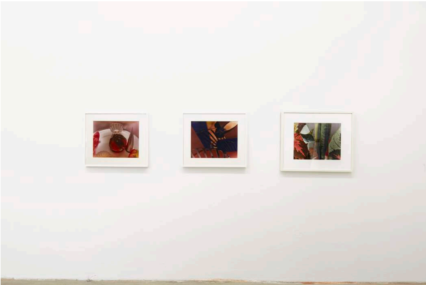
The Human Apparatus, 2015, installation shot KLEMM'S, Berlin