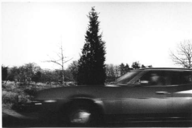
Untitled (A9), 1972, four gelatin silver prints