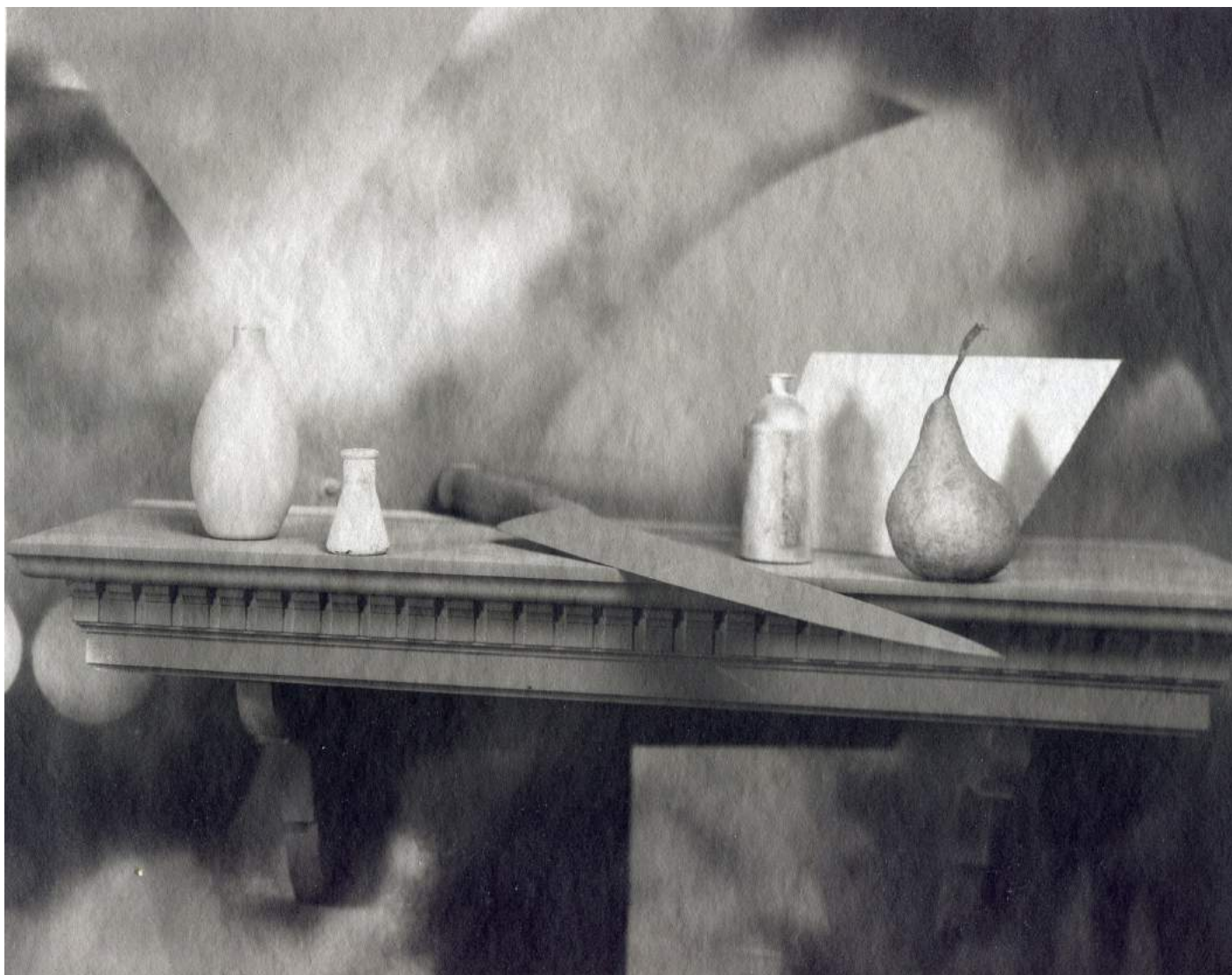
Untitled (1881), 1987, platinum palladium contact print, 20,3 x 25,4 cm