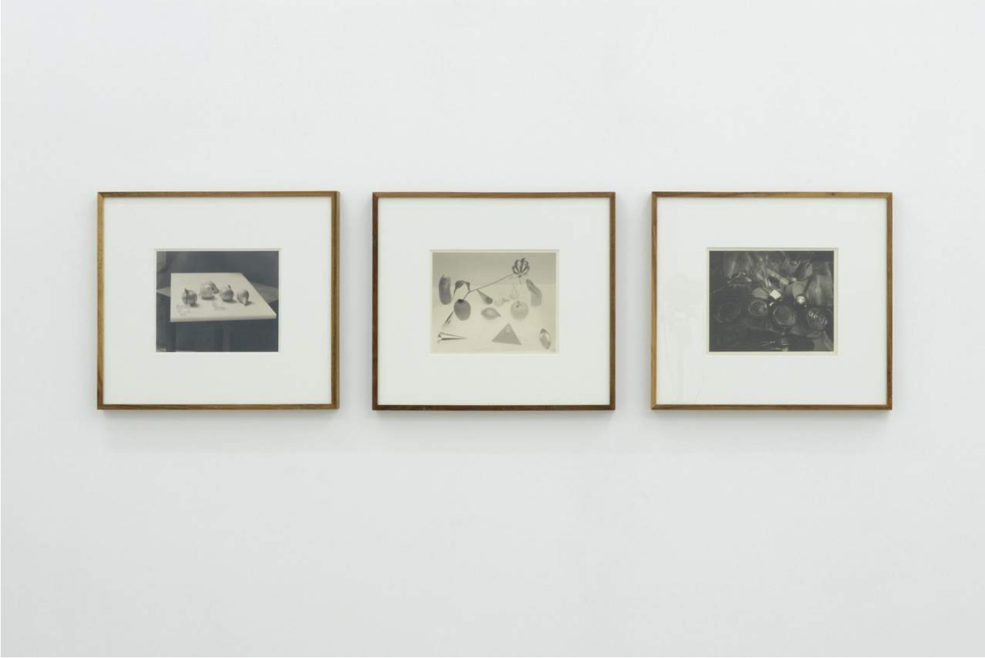
A Knife is A Knife, 2013/2014, installation view at Super Dakota, Brussels