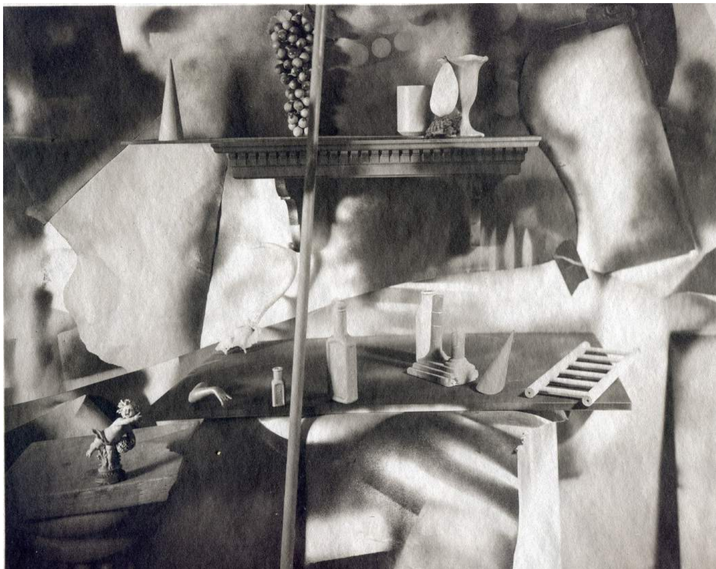
Untitled (1872), 1987, platinum palladium contact print, 20,3 x 25,4 cm