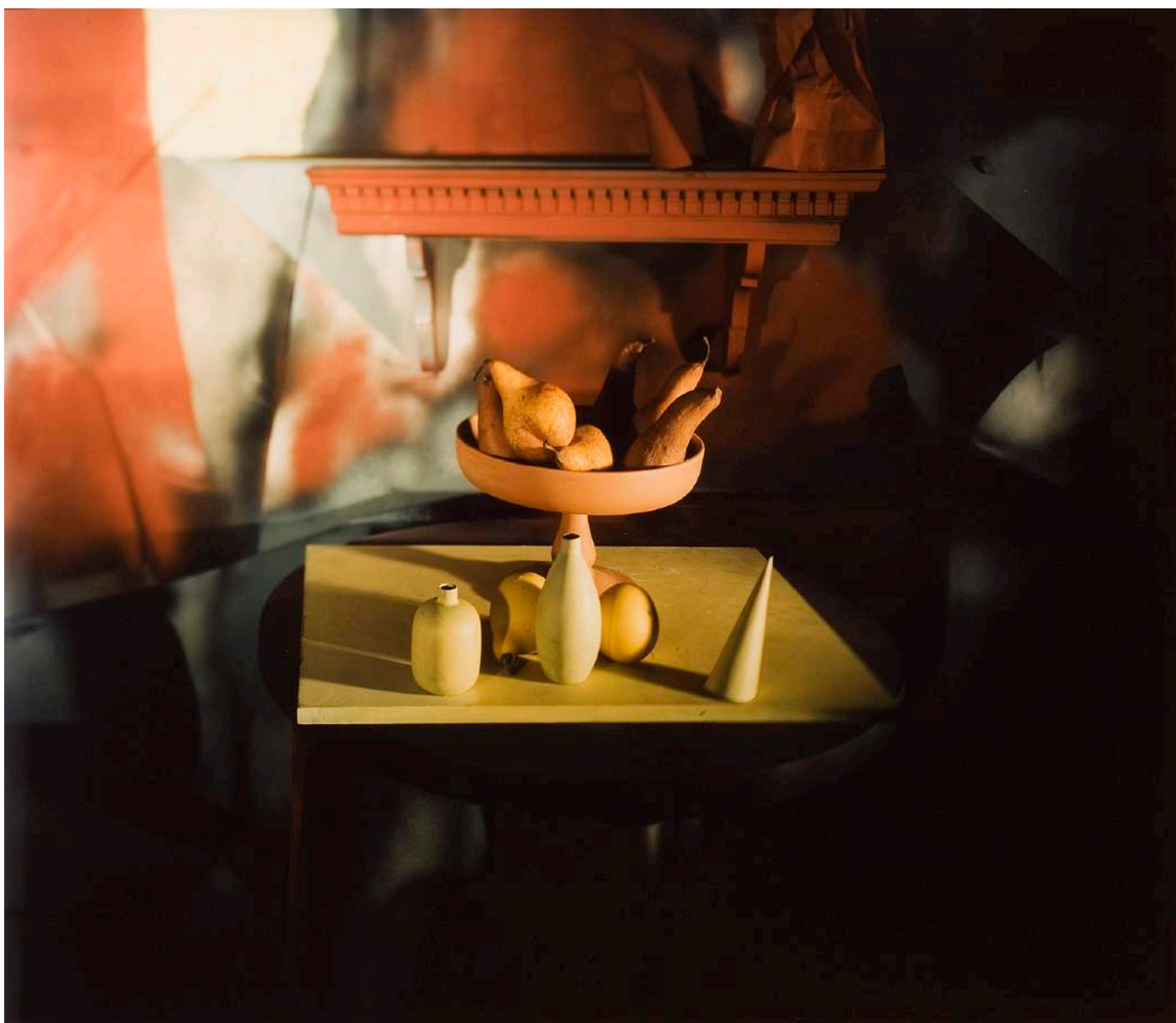
Untitled (CET161), 1989, chromogenic print