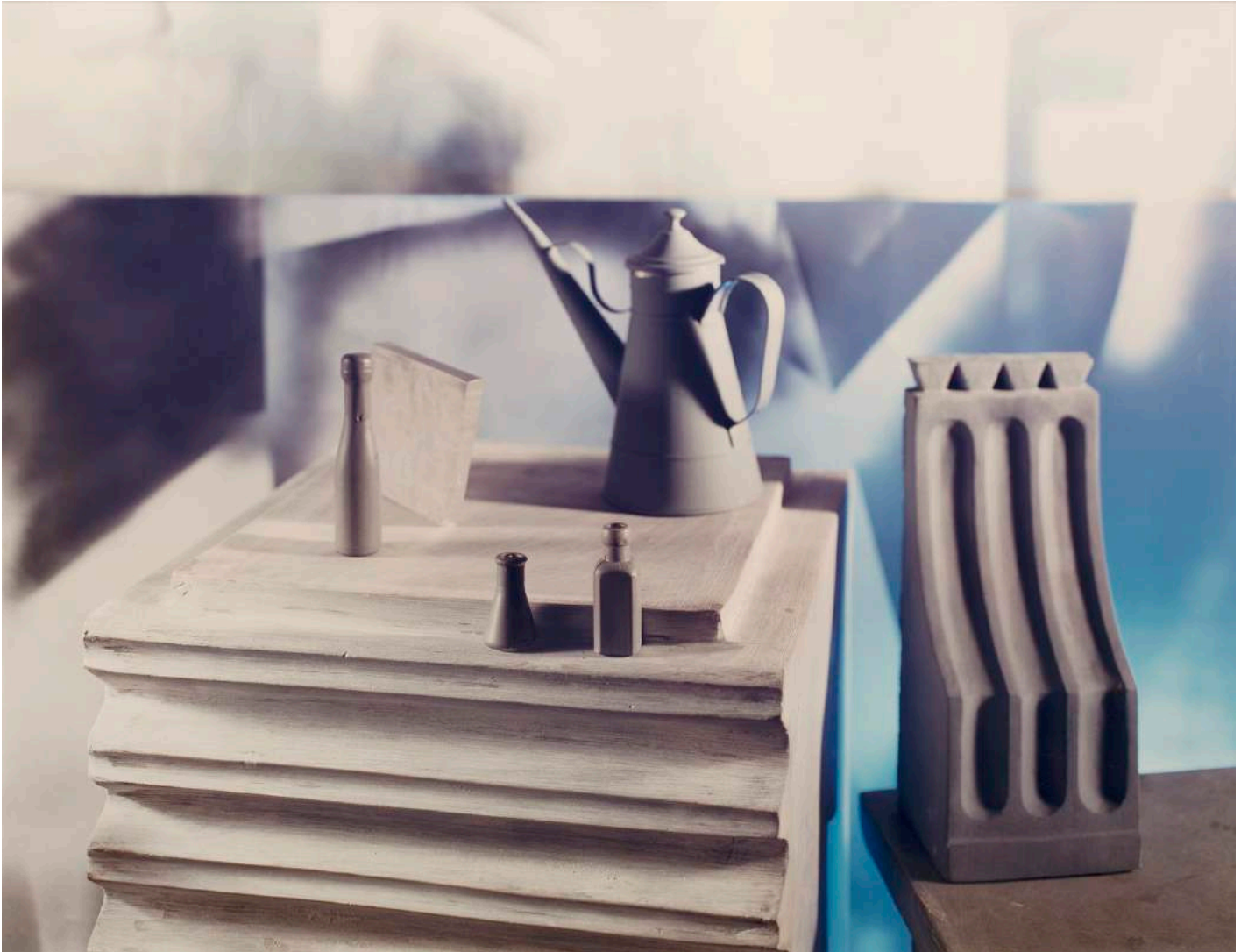
Untitled (215.1), 1988, chromogenic print