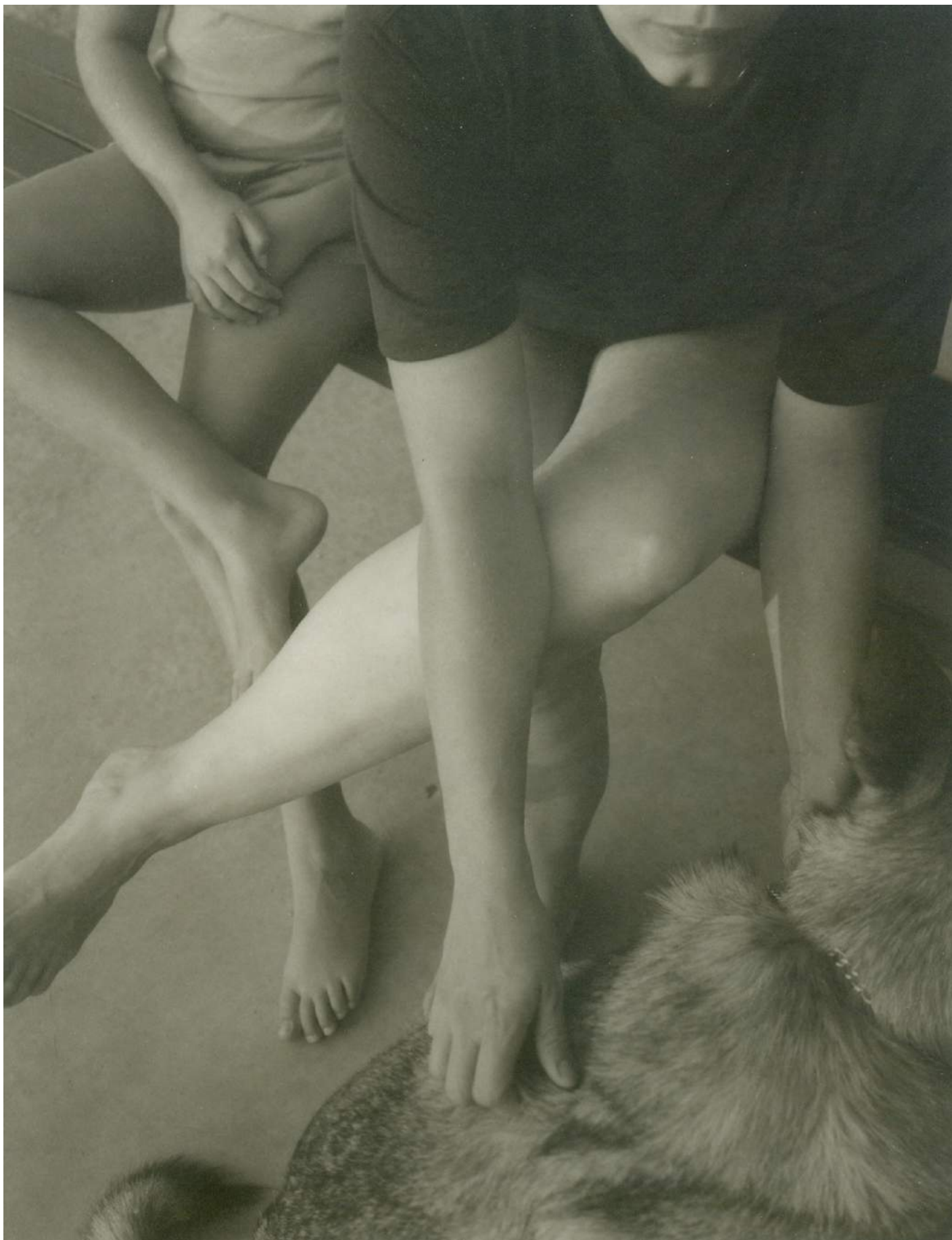
Untitled (1068), 1981, platinum palladium contact print, 25,4 x 20,3 cm