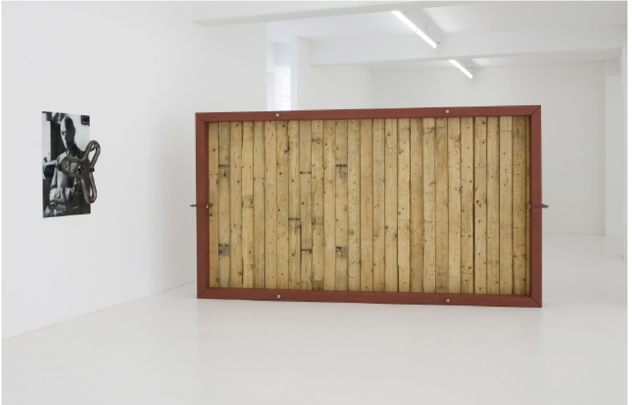
I'll never smile again, 2012, exhibition view at Philara Collection, Düsseldorf