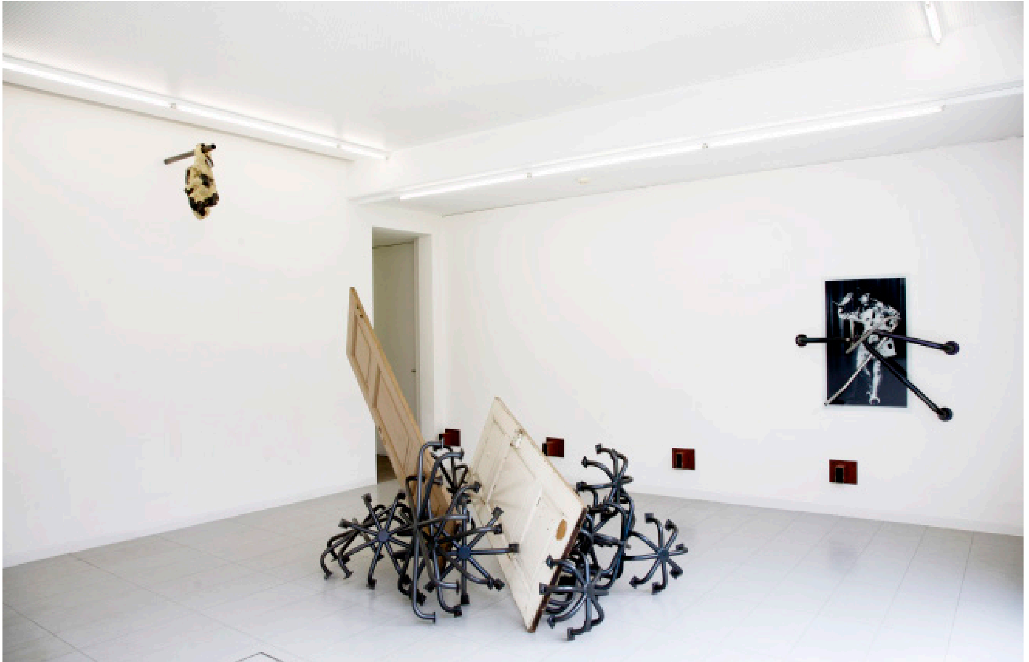
Demons Use Closed Doors, 2008; Basic Line, 2010; Rudolf Lutz in a Dadaistic Women's Costume, 2009