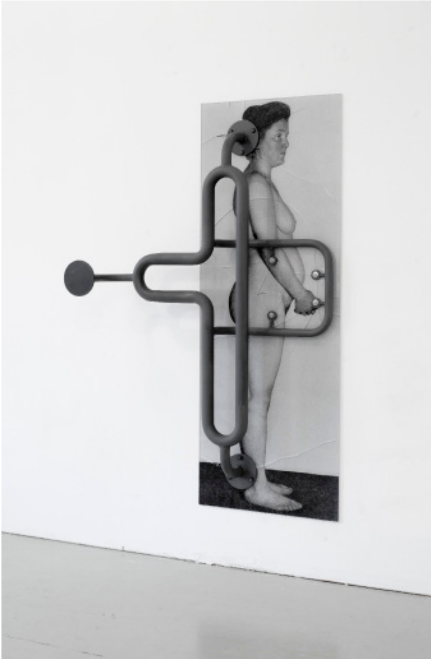
Das Rätsel der Sphinx, 2009, b/w photography, glass, steel pipe, lacquer, 139,5 x 86 x 30 cm