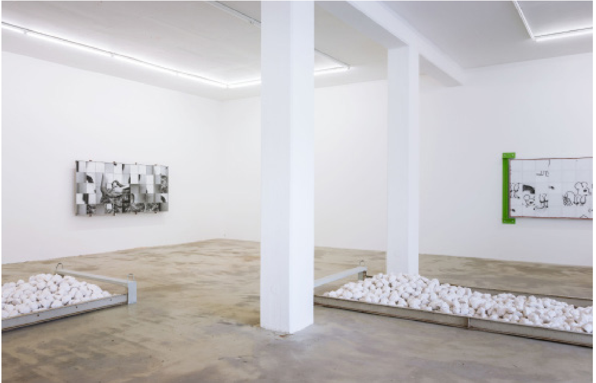
Two thousand Profiles, 2015, exhibition view at KLEMM'S, Berlin