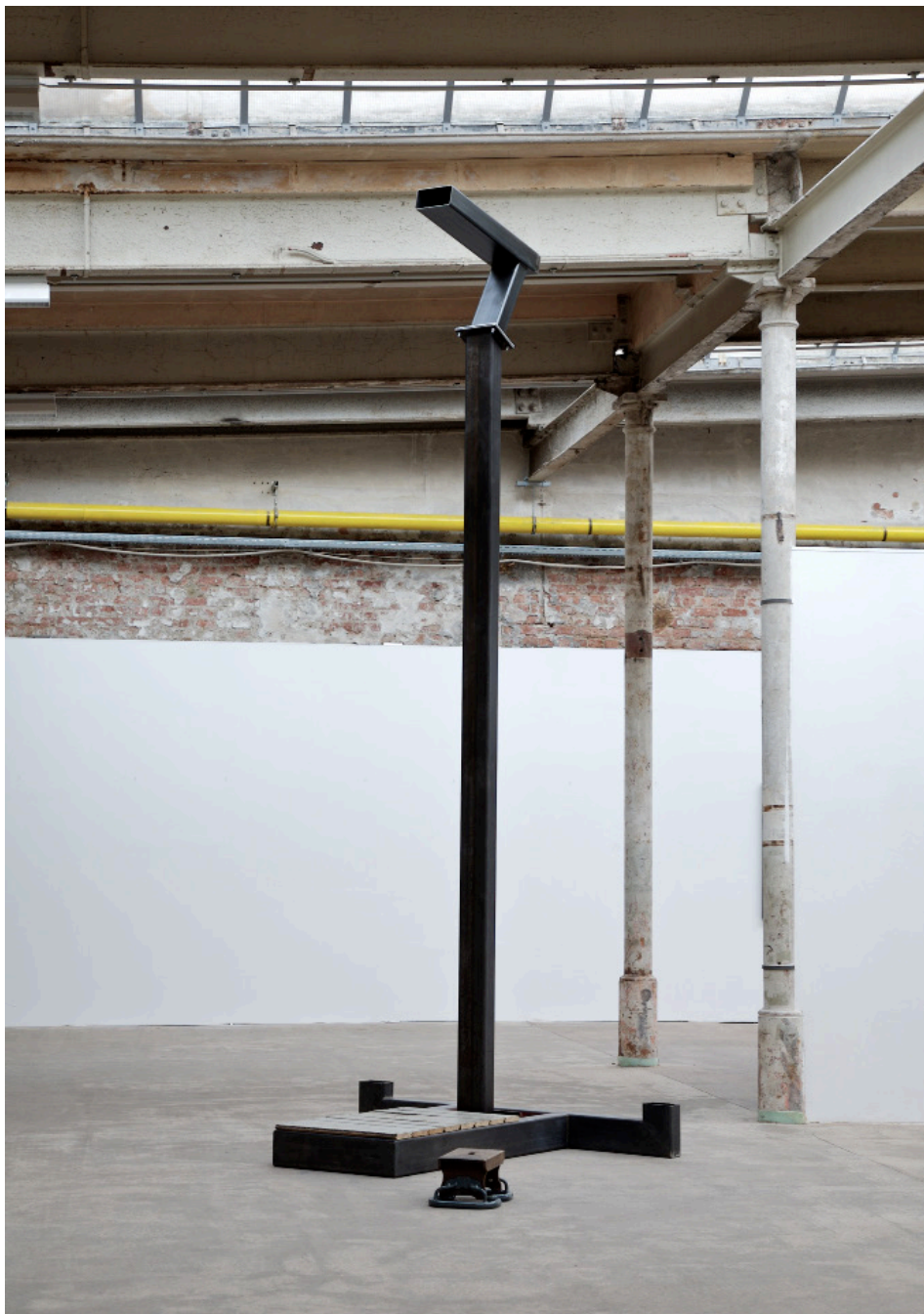
Egoist, 2009, steel, wood, lacquer, 460 x 200 x 250 cm