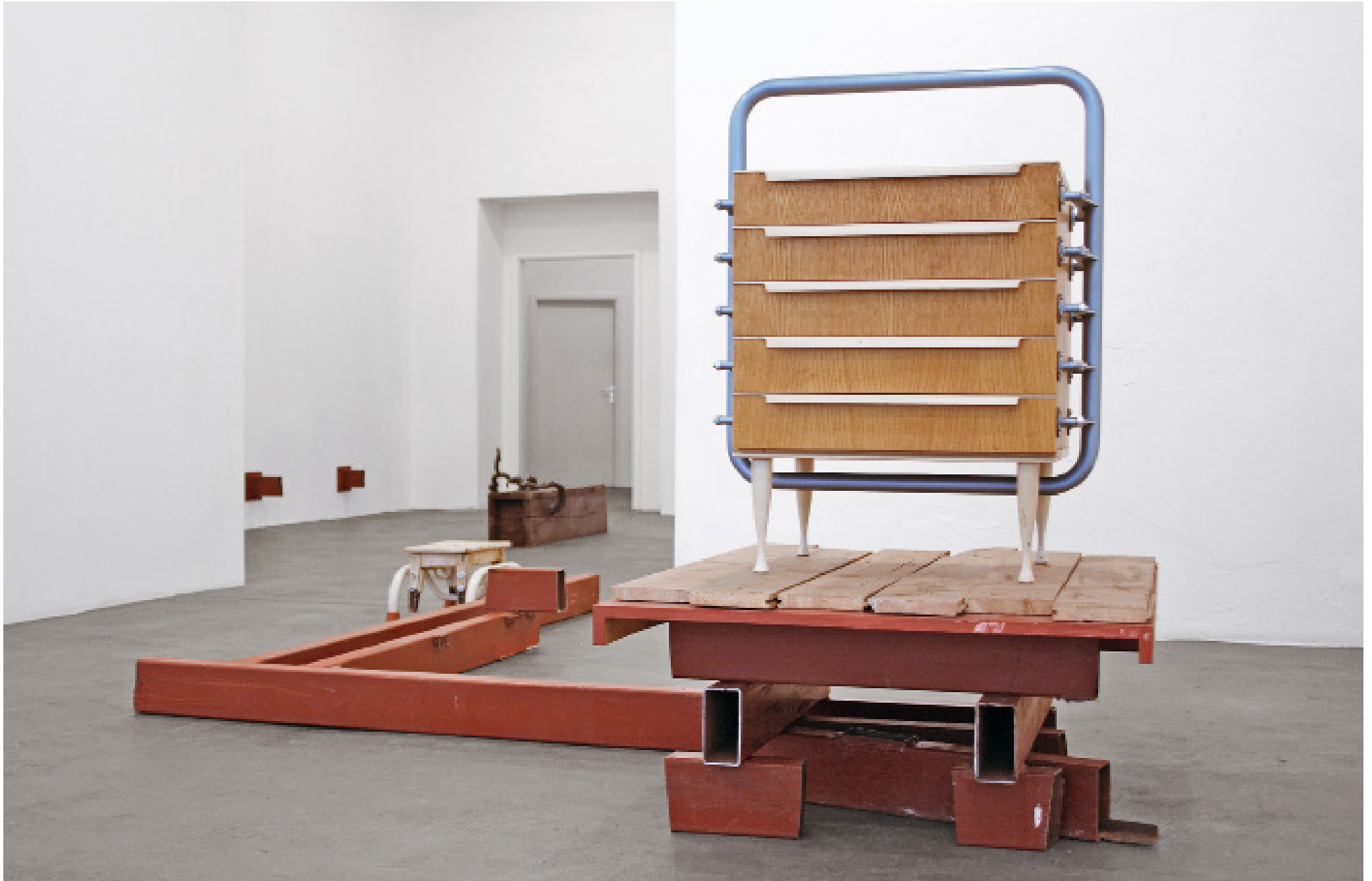
Amorphe Form in Mausefalle, 2006, exhibition view at AMERIKA, Berlin