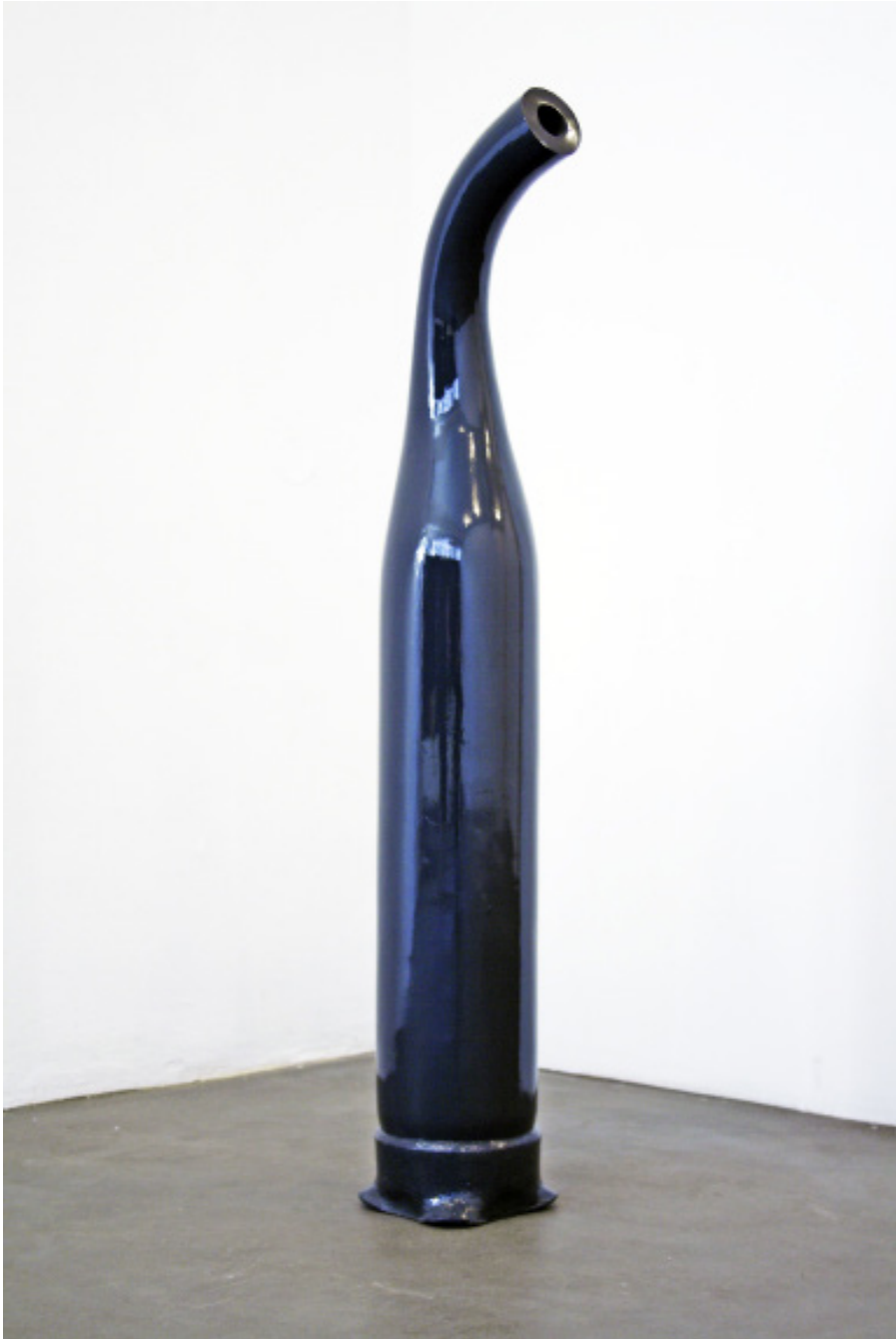
Flasche, 2008, steel, lacquer, 138 x 20 x 30 cm