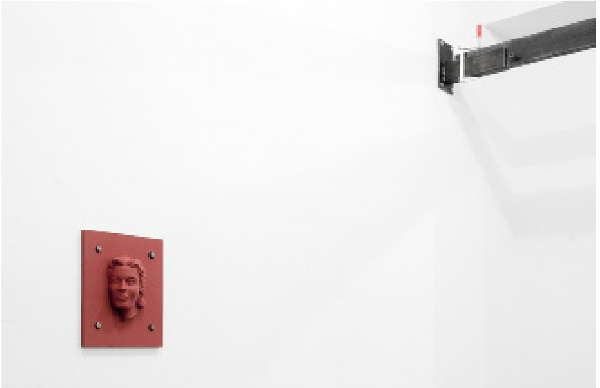
Emmas Bett, 2010, gum, pigments, steel, 39 x 34 x 9 cm