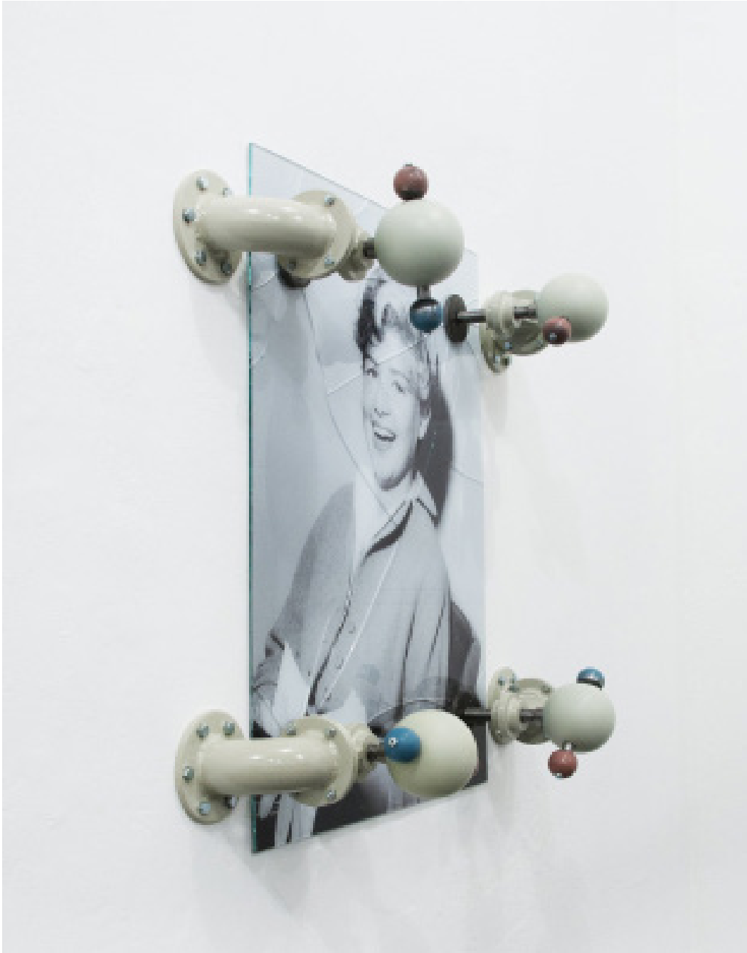
Globales Phänomen, 2012, steel, lacquer, glass, b/w-photography, 81 x 93 x 21 cm