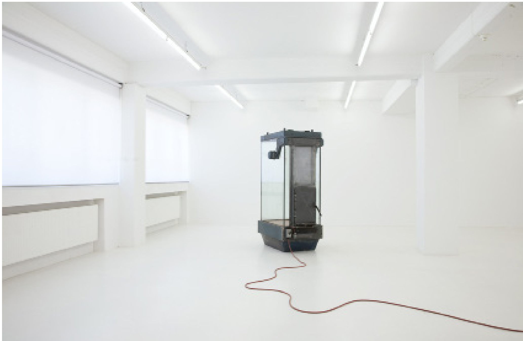
Feierabend, 2012, steel, glass, soundsytsem, soundfile, 215 x 104 x 76 cm