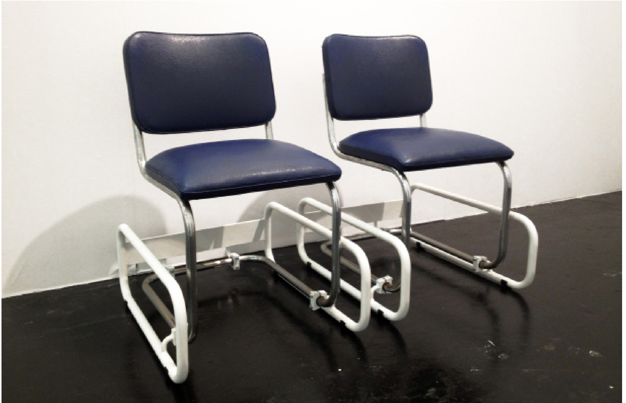
Polsterstuhl 4 (a/b), 2013, 2 chairs, steelpipe, lacquer, each 85 x 55 x 55 cm