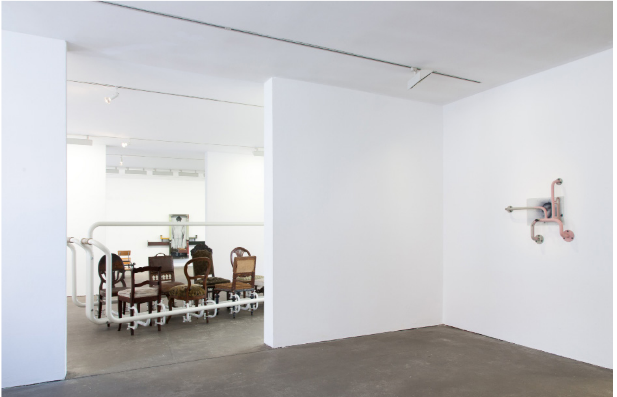
Das Gegengen, 2013, exhibition view at Kunstverein Graftschaft Bentheim