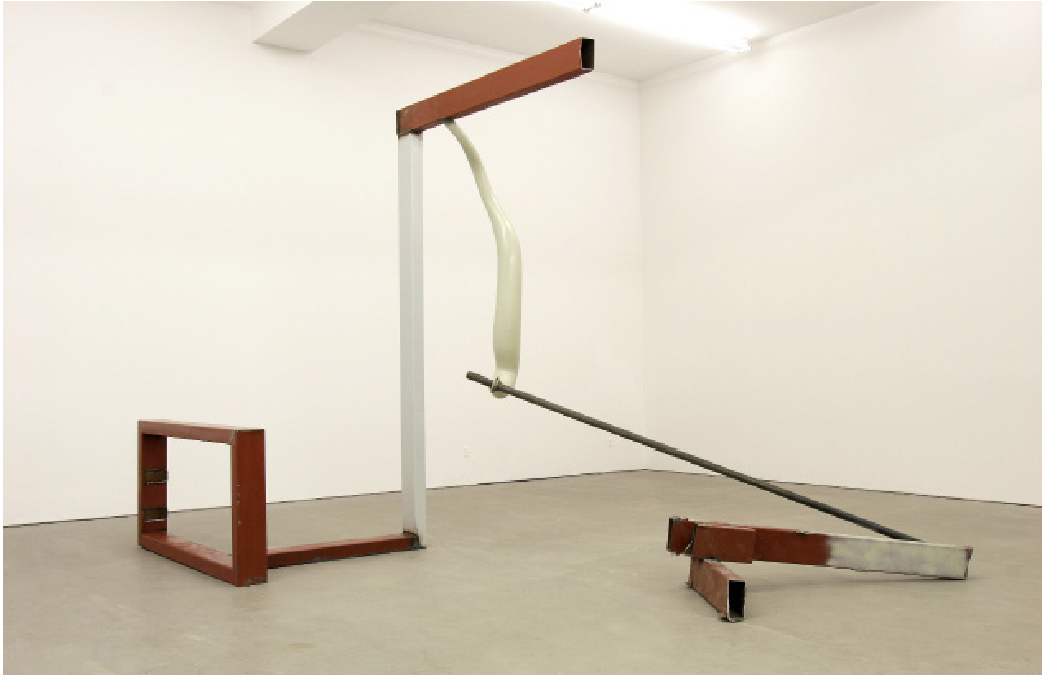
The Birth of the Hygienic, 2007, steel, lacquer, 205 x 250 x 250 cm