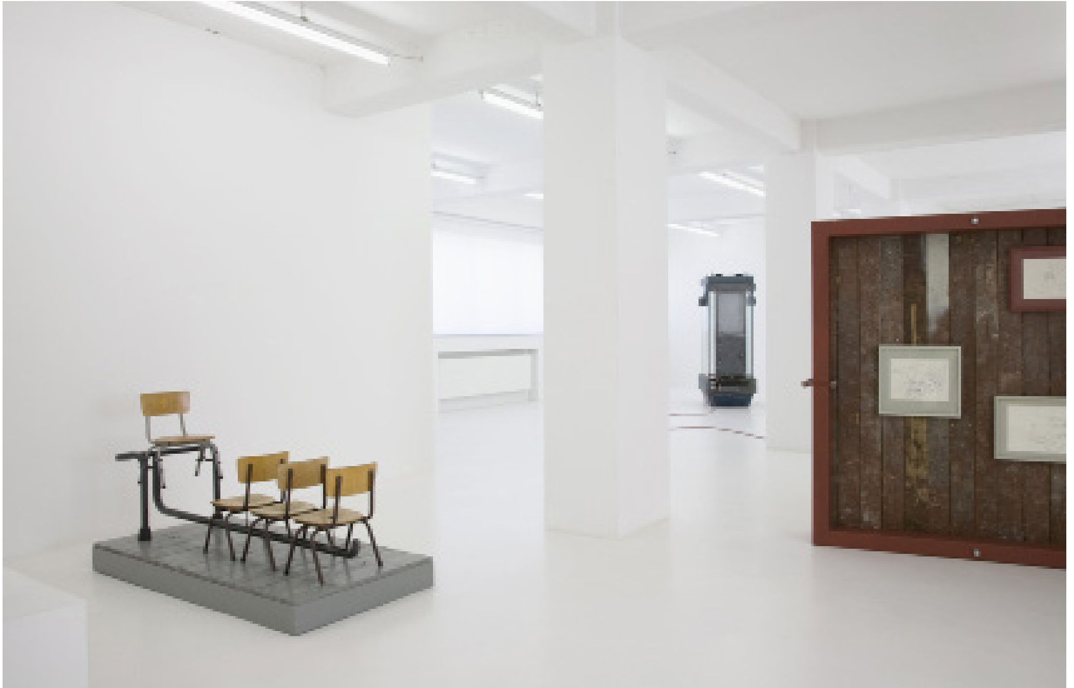
I'll never smile again, 2012, exhibition view at Philara Collection, Düsseldorf