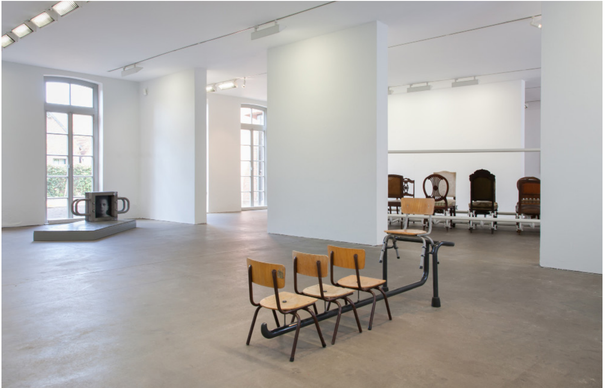
Das Gegengen, 2013, exhibition view at Kunstverein Graftschaft Bentheim