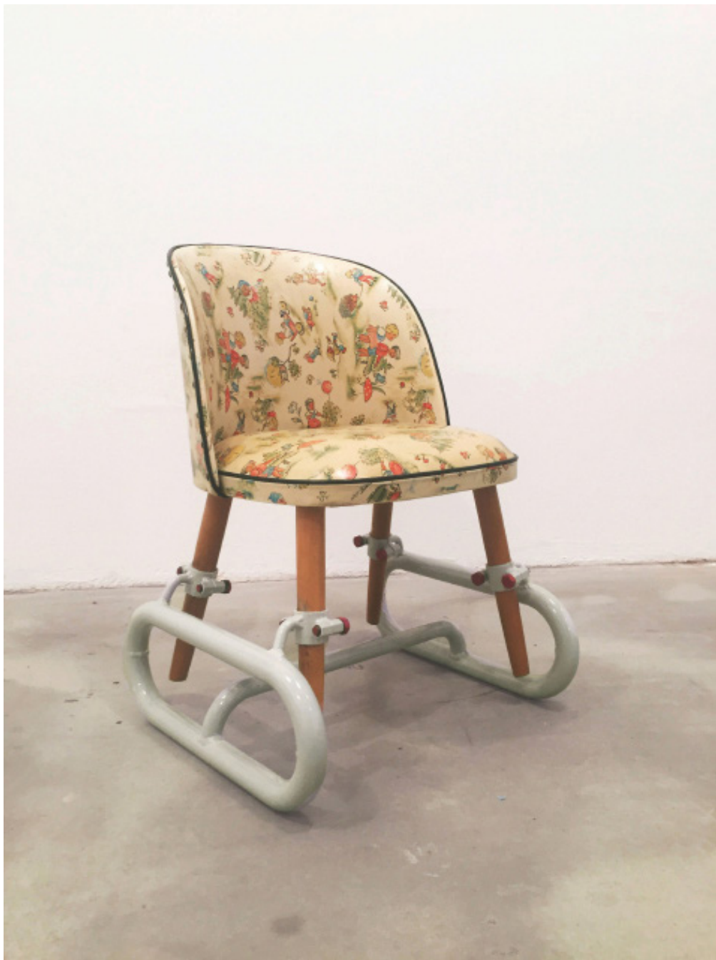
Stahl 26 A26 d16, wbitieresleebprijazemish, 55 x 36 x 40 cm