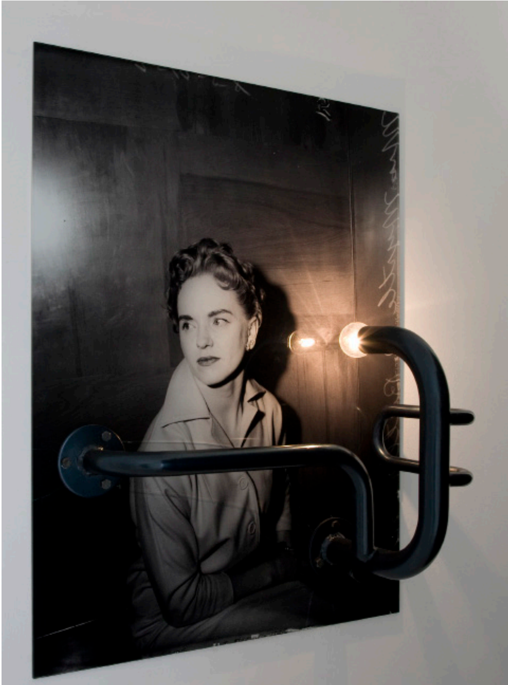
Sitting in the Dark, 2012, steel pipe, b/w-photography, glass, lacquer, electronics, 85,5 x 65 x 26 cm