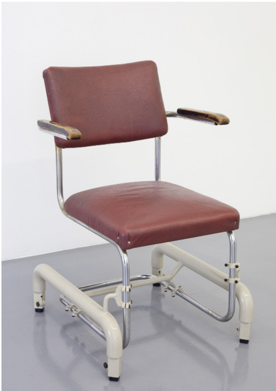
Polsterstuhl Nr. 3, 2013, chair, steel pipe, lacquer, 87 x 61 x 56 cm