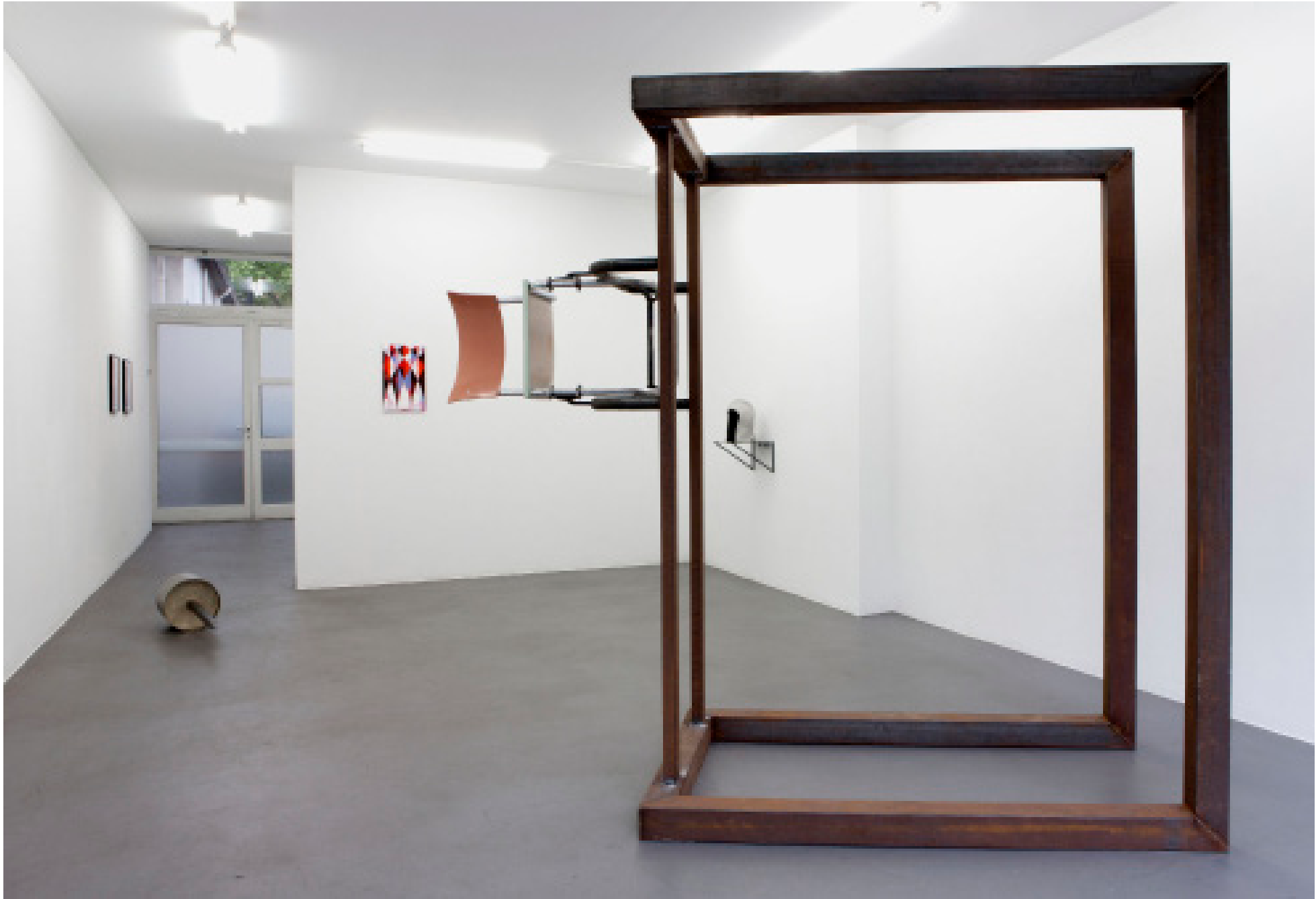
Ground Control to Major Tom, 2014, exhibition view at Galerie Marion Scharmann, Köln