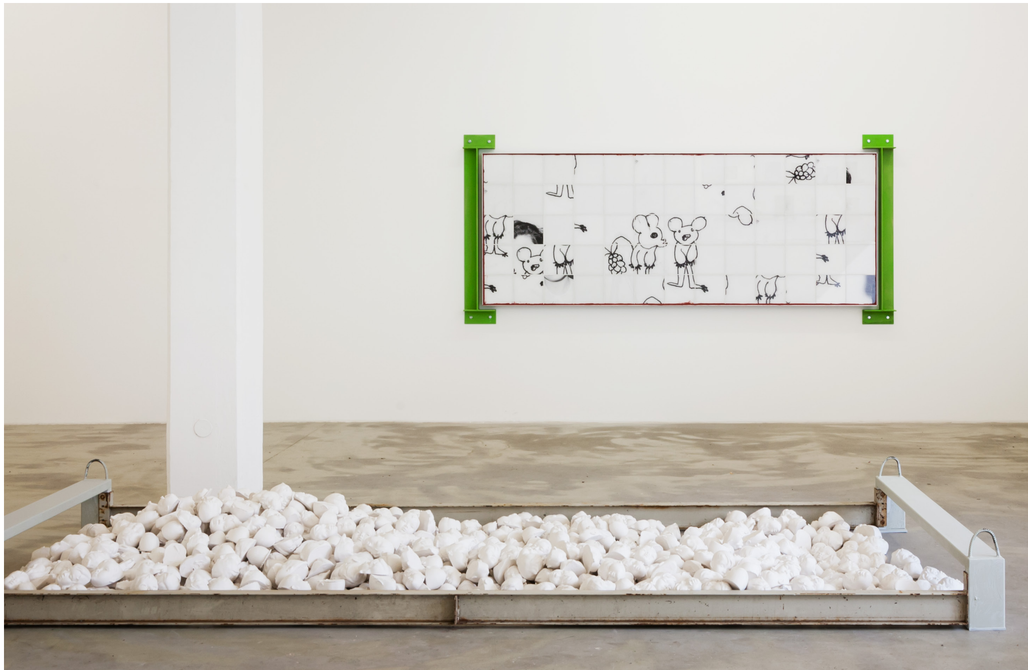
Two thousand Profiles, 2015, exhibition view at KLEMM'S, Berlin