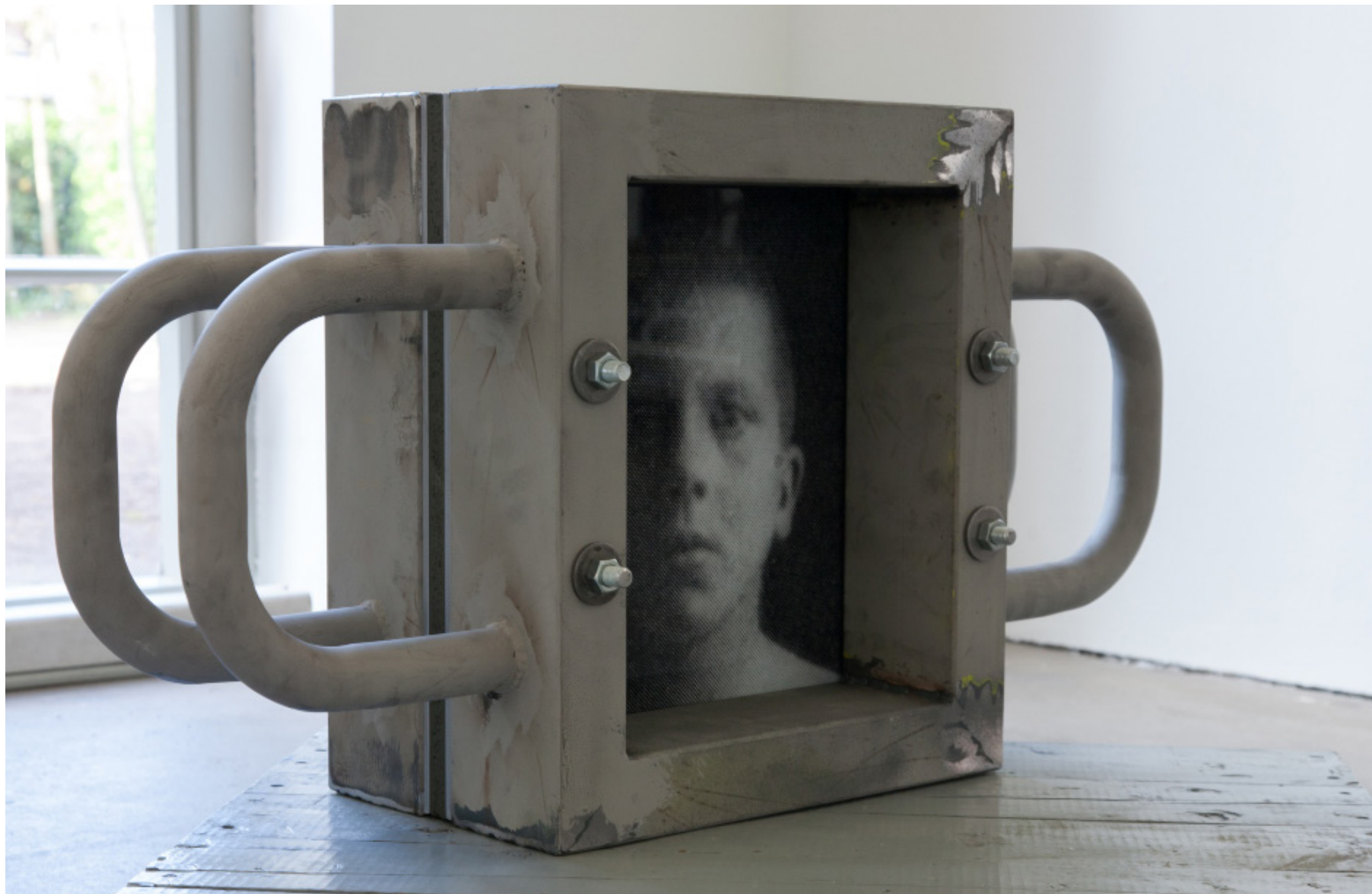
Dummy, 2013, steel, wood, b/w-photographs, glass, lacquer, 51 x 94 x 34 cm