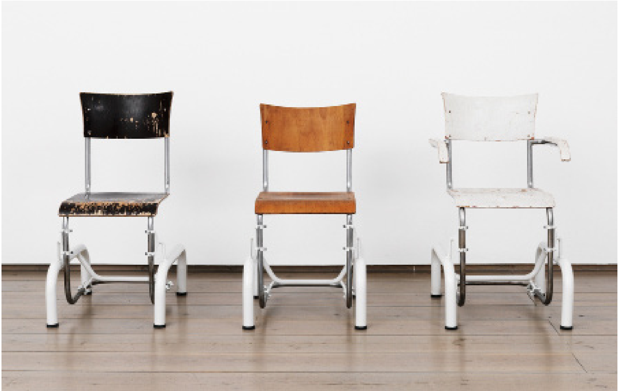
Stuhl 9 (a); Stuhl 9 (b); Stuhl 9 (c), 2007, steelpipe, found furniture, dimensions variable