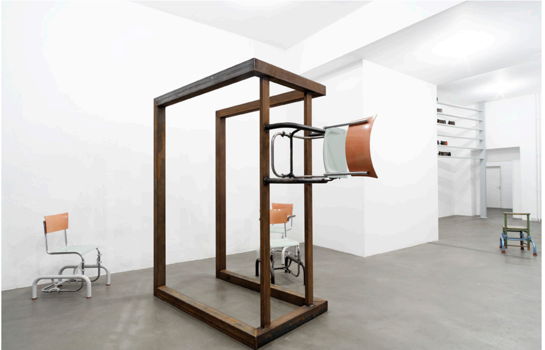
Come to Daddy, 2008, exhibition view at KLEMM'S, Berlin