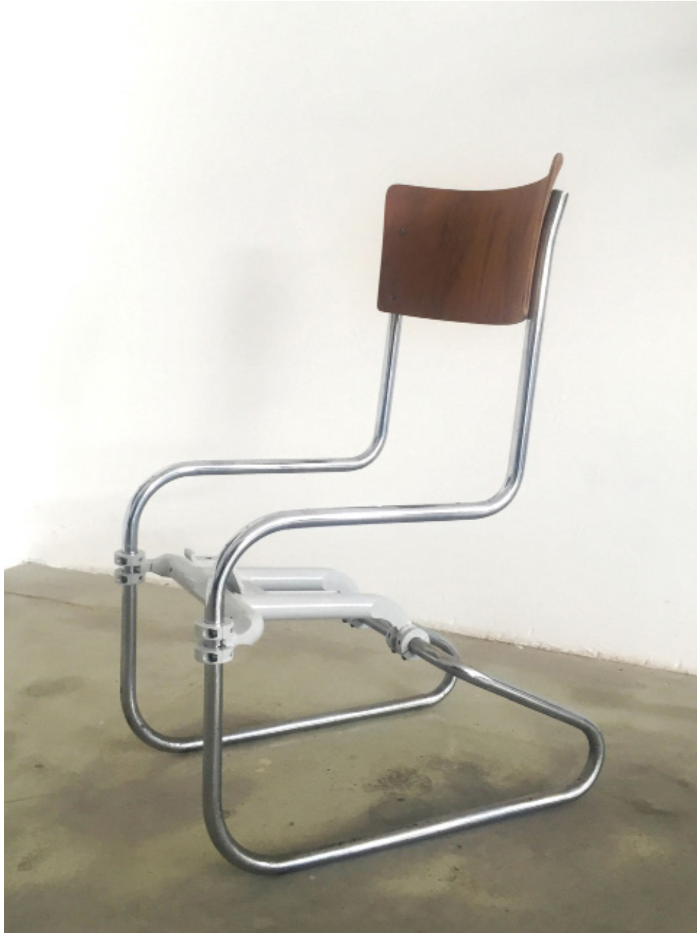
Stuhl 28, 2016, chair, steel pipe, varnish, 86 x 55 x 37 cm