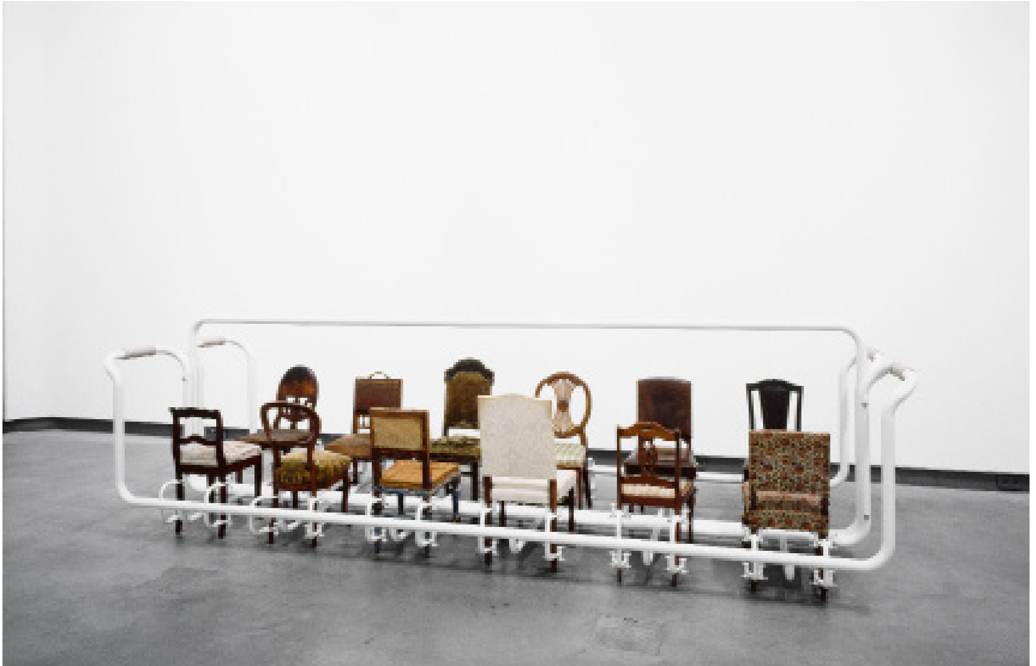
Bopparder Kanapee, 2005, found furniture, steelpipe, plastic, lacquer, 160 x 520 x 180 cm