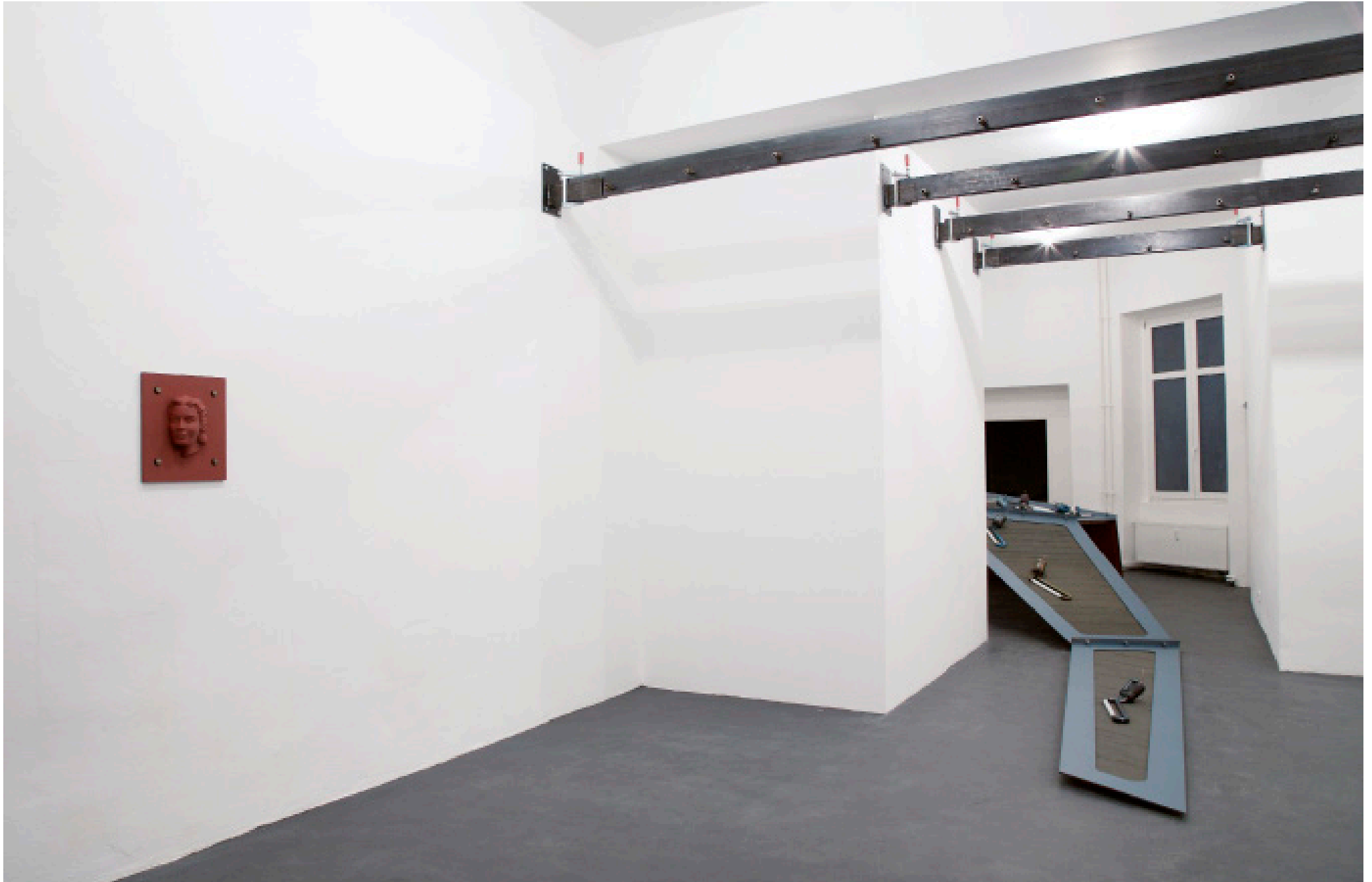
Feierabend, 2010, steel, wood, lacquer, 13 neonbulbs, cables, engraved plates, 835 x 198 x 104 cm