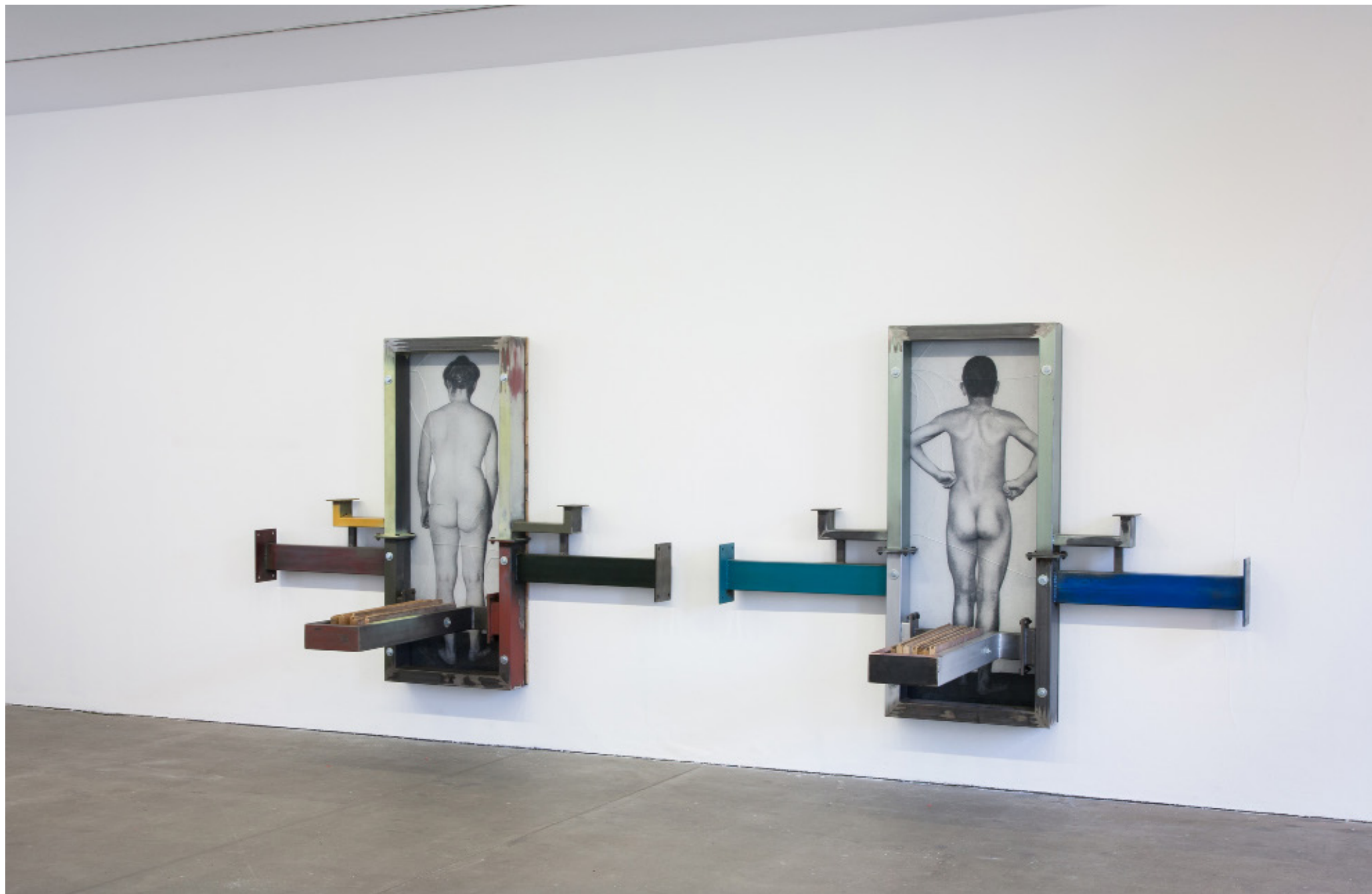
background, 2011, steel, wood, glass, b/w-photographs, lacquer, 165 x 200 x 180 cm (dimensions variable)