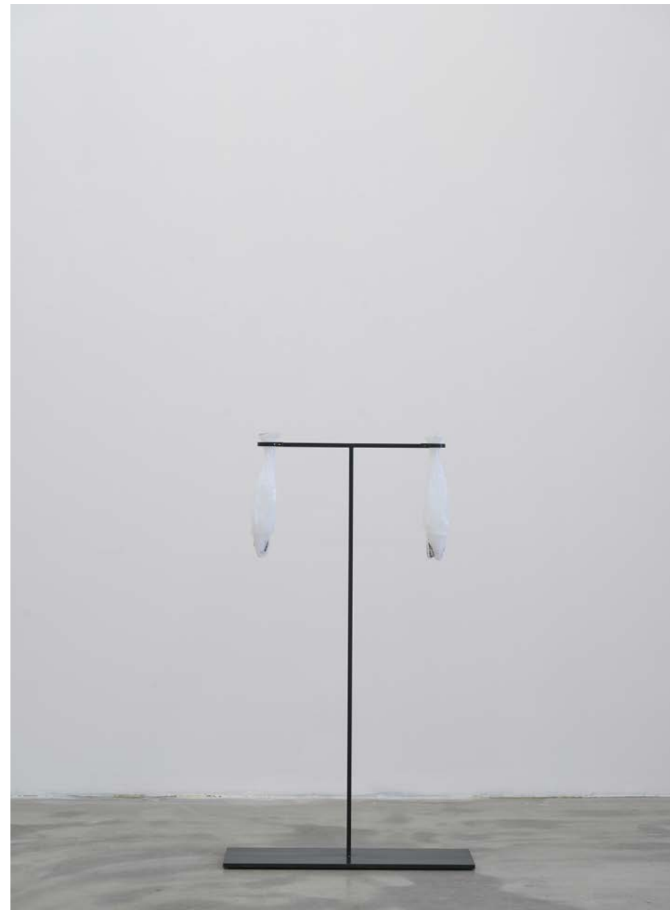
Fish stand with fish,2019, hand-blown glass, copper, blackened steel, 120 x 70 x 22 cm