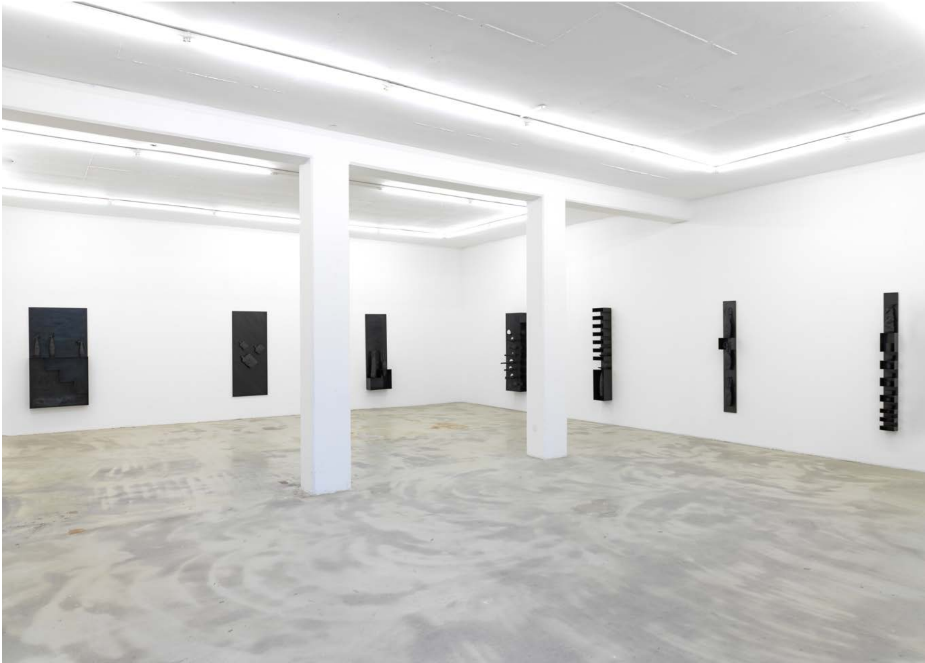
itself & else, 2022, Klemm's, Berlin