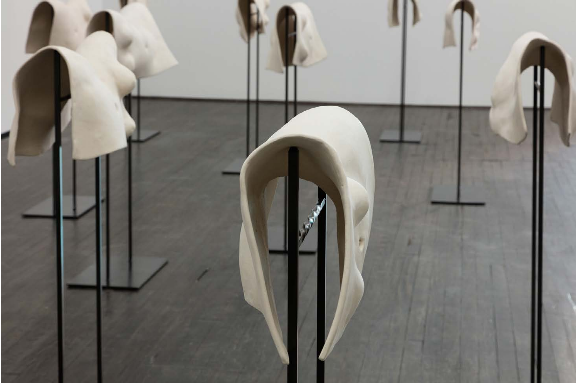
installation view of Pommel, 2017, ceramic, blackened steel