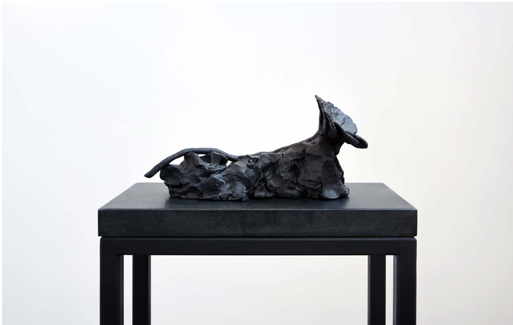
Odalisque (detail), 2016, Ceramic, granite, steel, human hair