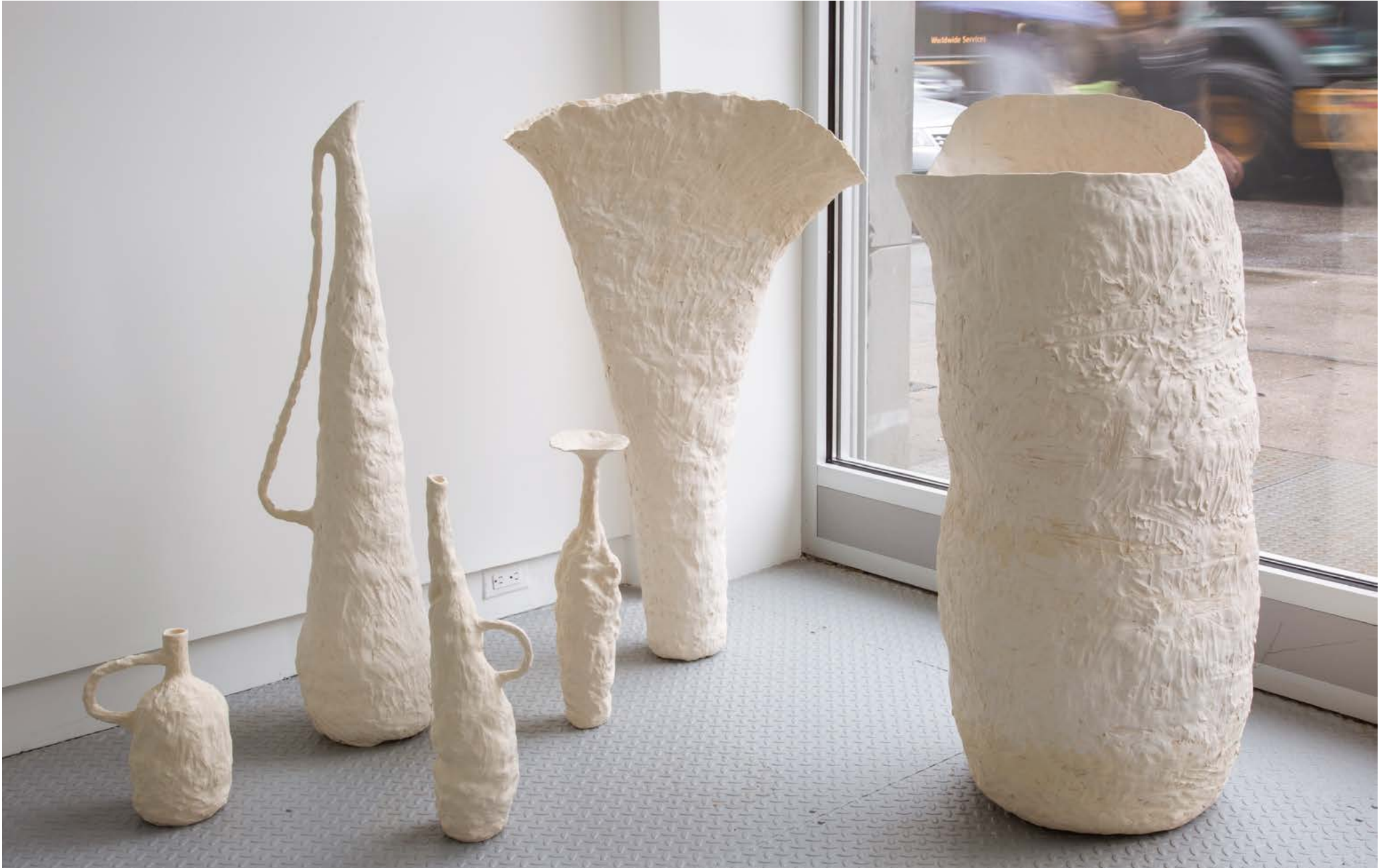
Blonde Pots, 2017, ceramic