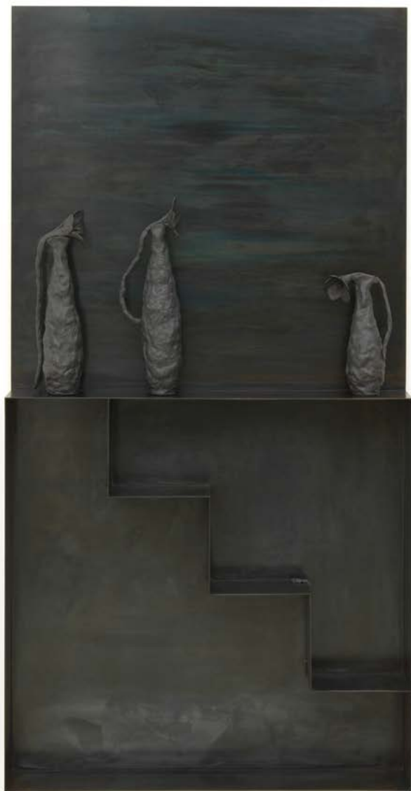
Untitled 7 (Where have you been?) 2022 ceramic, blackened steel 160 x 80 x 12,5 cm