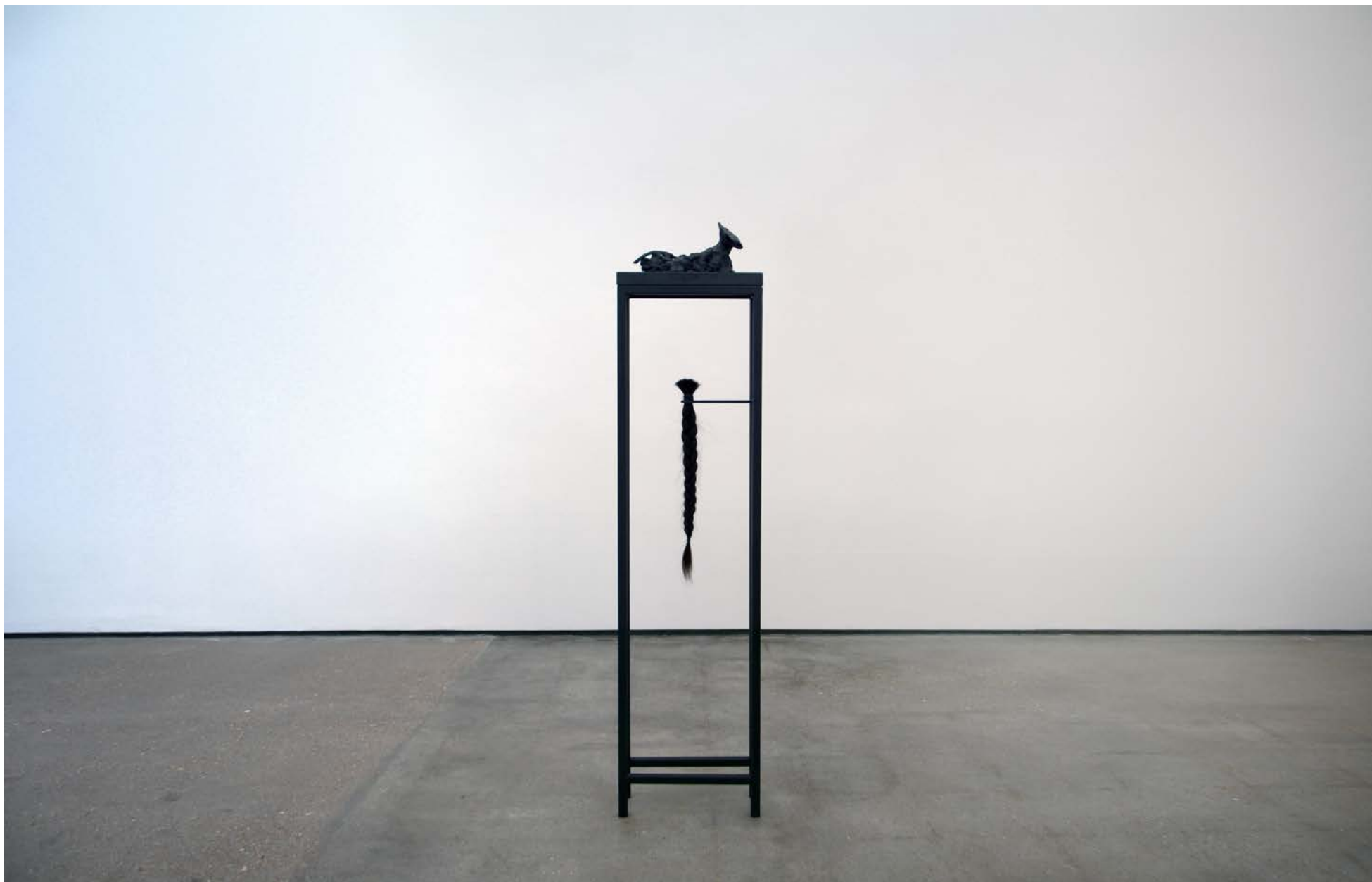
Odalisque, 2016, ceramic, granite, steel, human hair