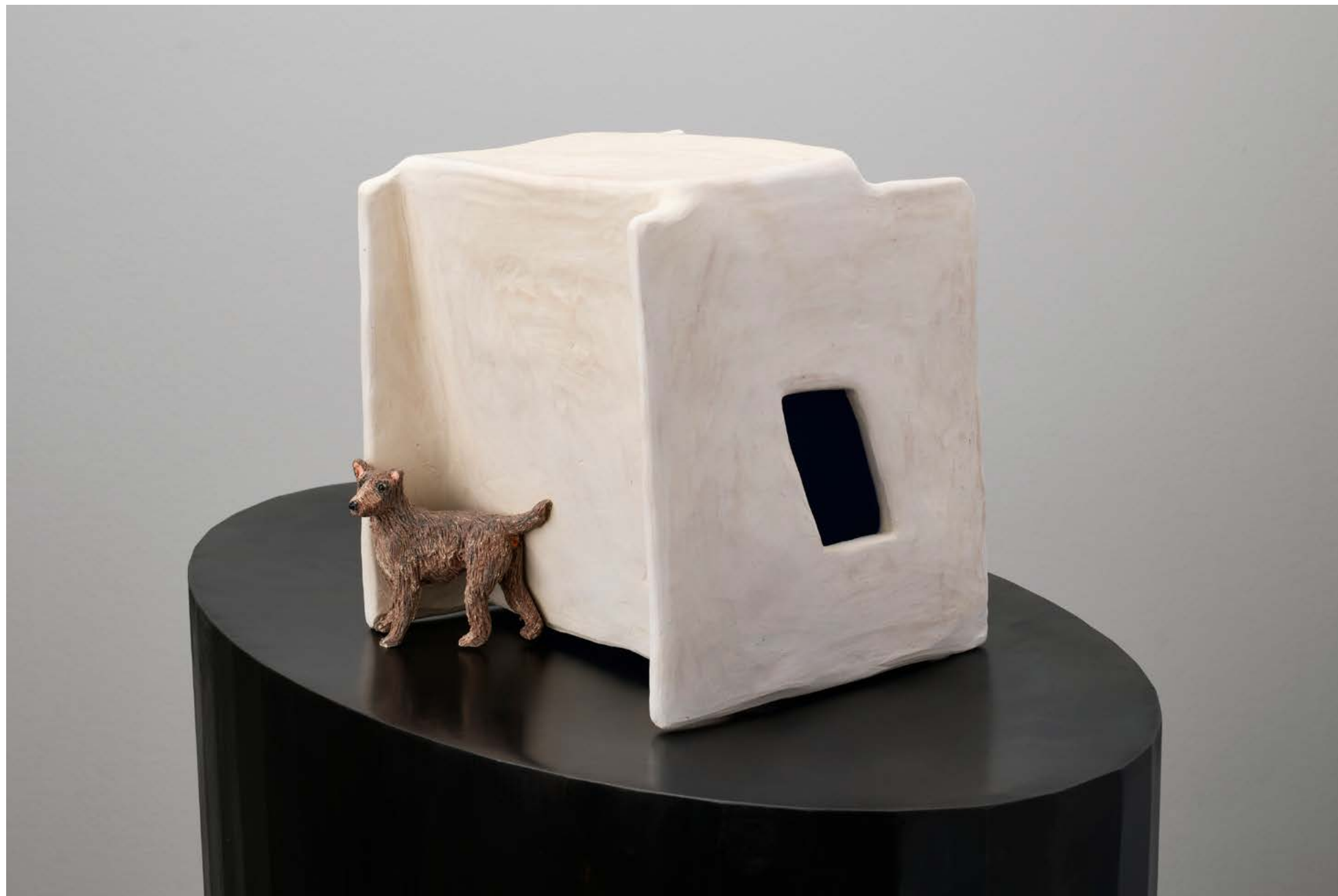
Lost dog 2021 ceramic 17,78 x 17,78 x 20,32 cm