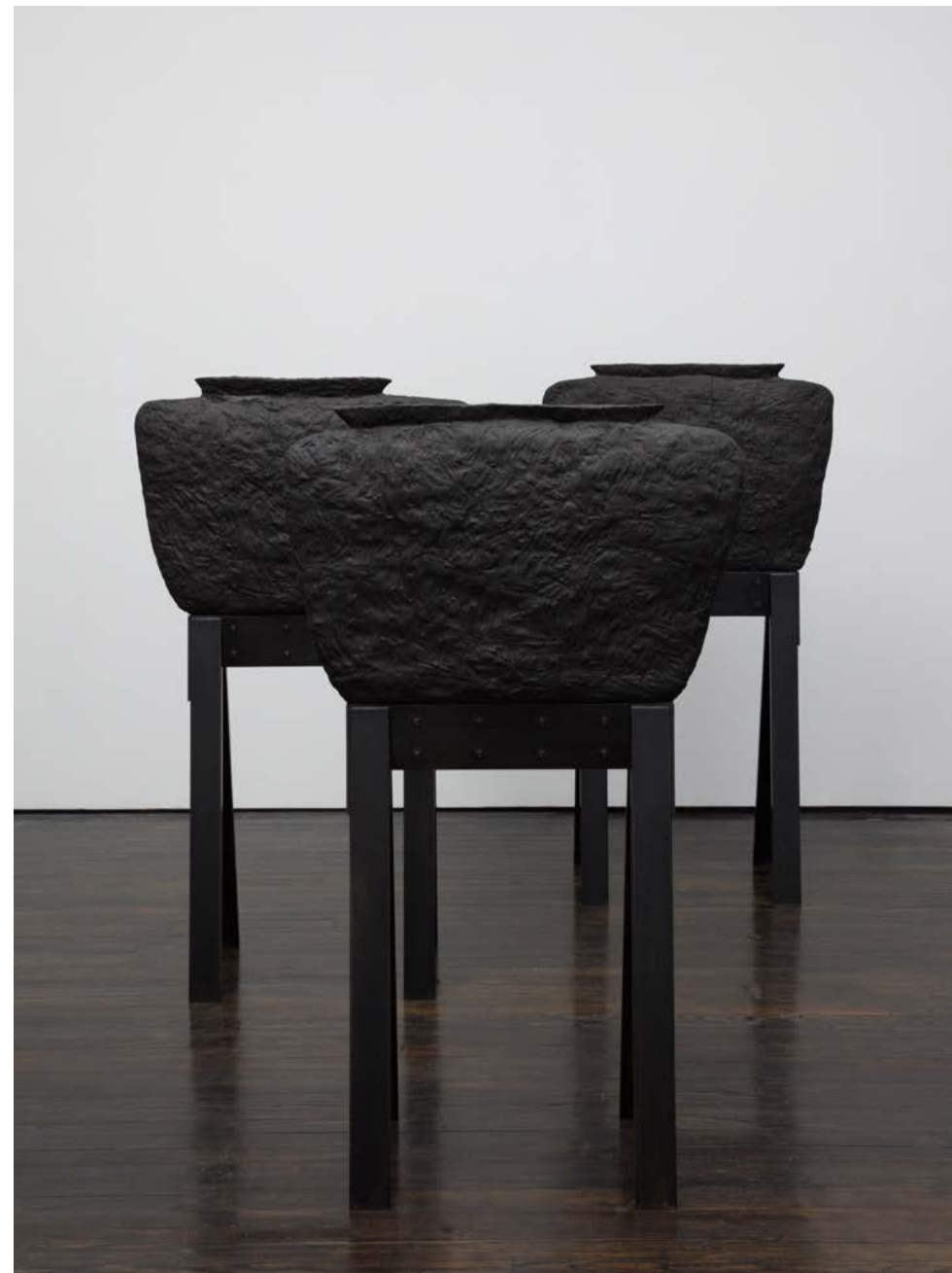
Portrait of a Man (Jack Jaeger), 2016, ceramic, blackened steel, magnetic sand