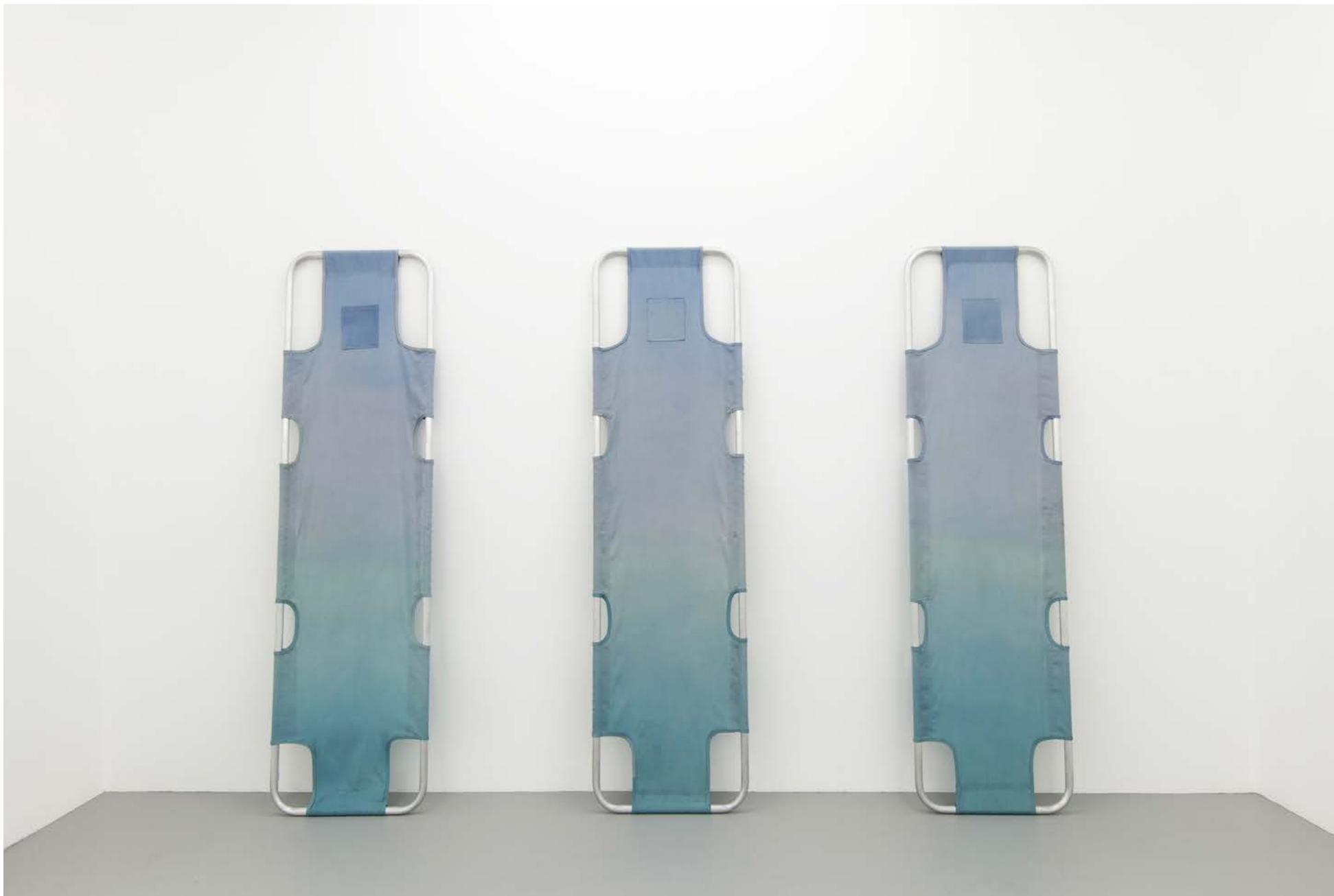
8:30, 2015, hand dyed silk and hand bent aluminum, ceramic and hair, italian sourced leather, peas, foam, steel