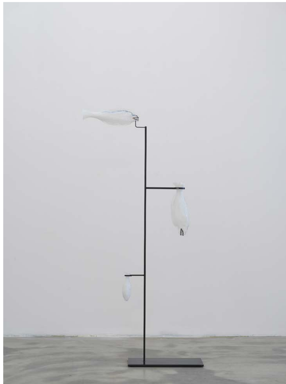
Fish stand with fish,2019, hand-blown glass, copper, blackened steel, 190 x 80 x 22 cm