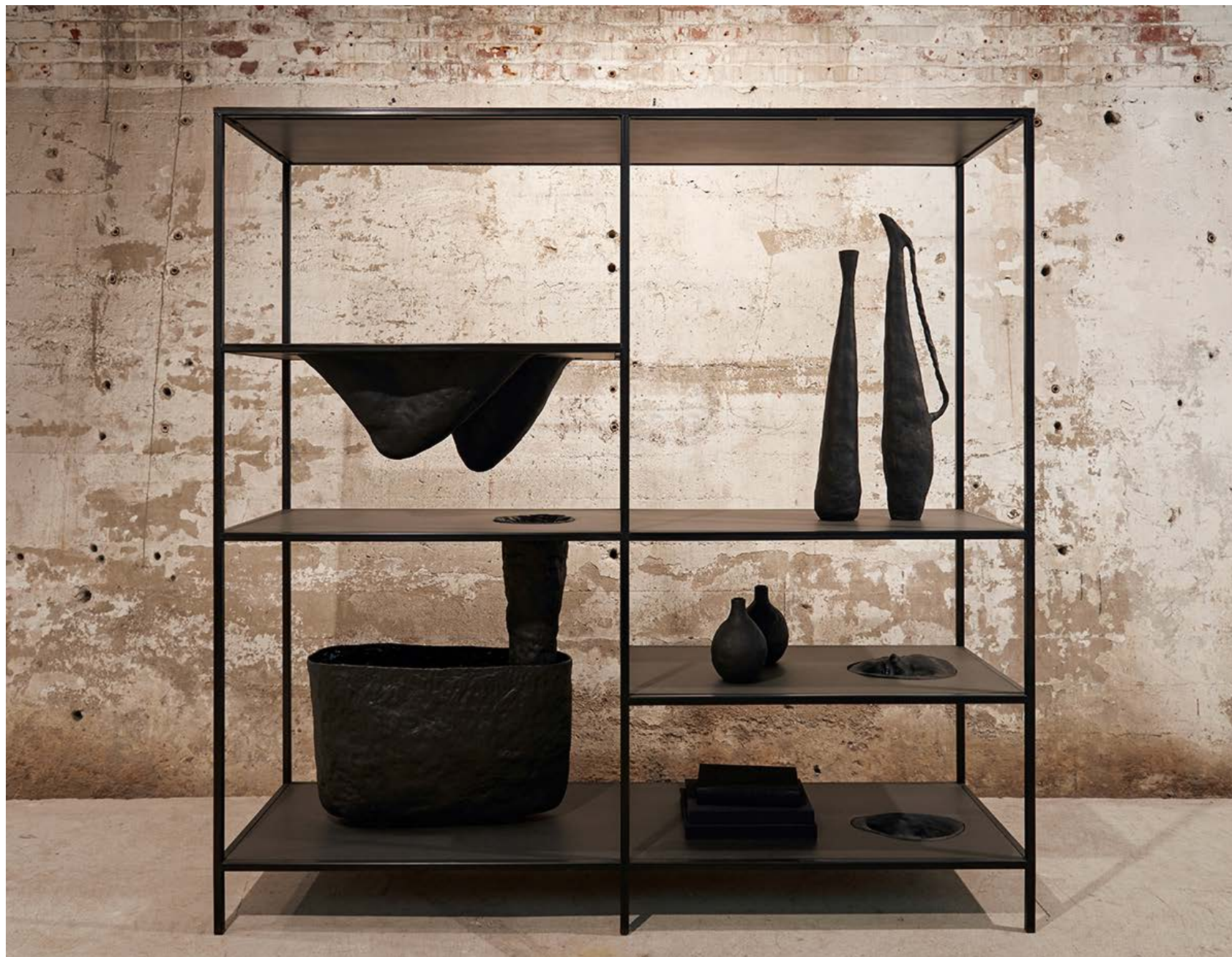
Bookcase 3, 2016, ceramic, MDF, blackened steel, handmade books