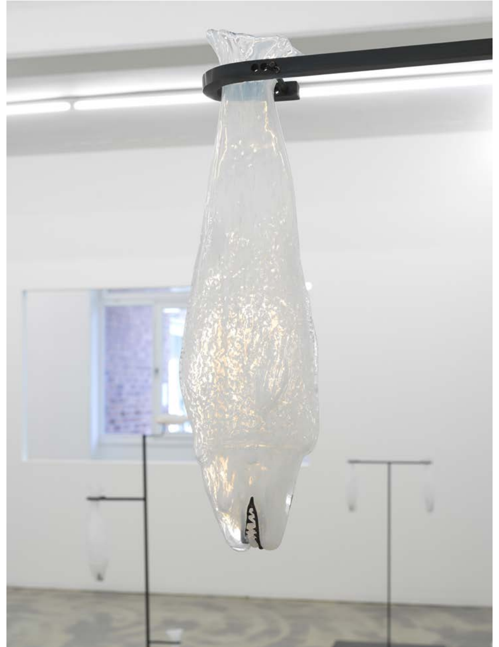
Fish stand with fish, 2019, hand-blown glass, copper, blackened steel, detail