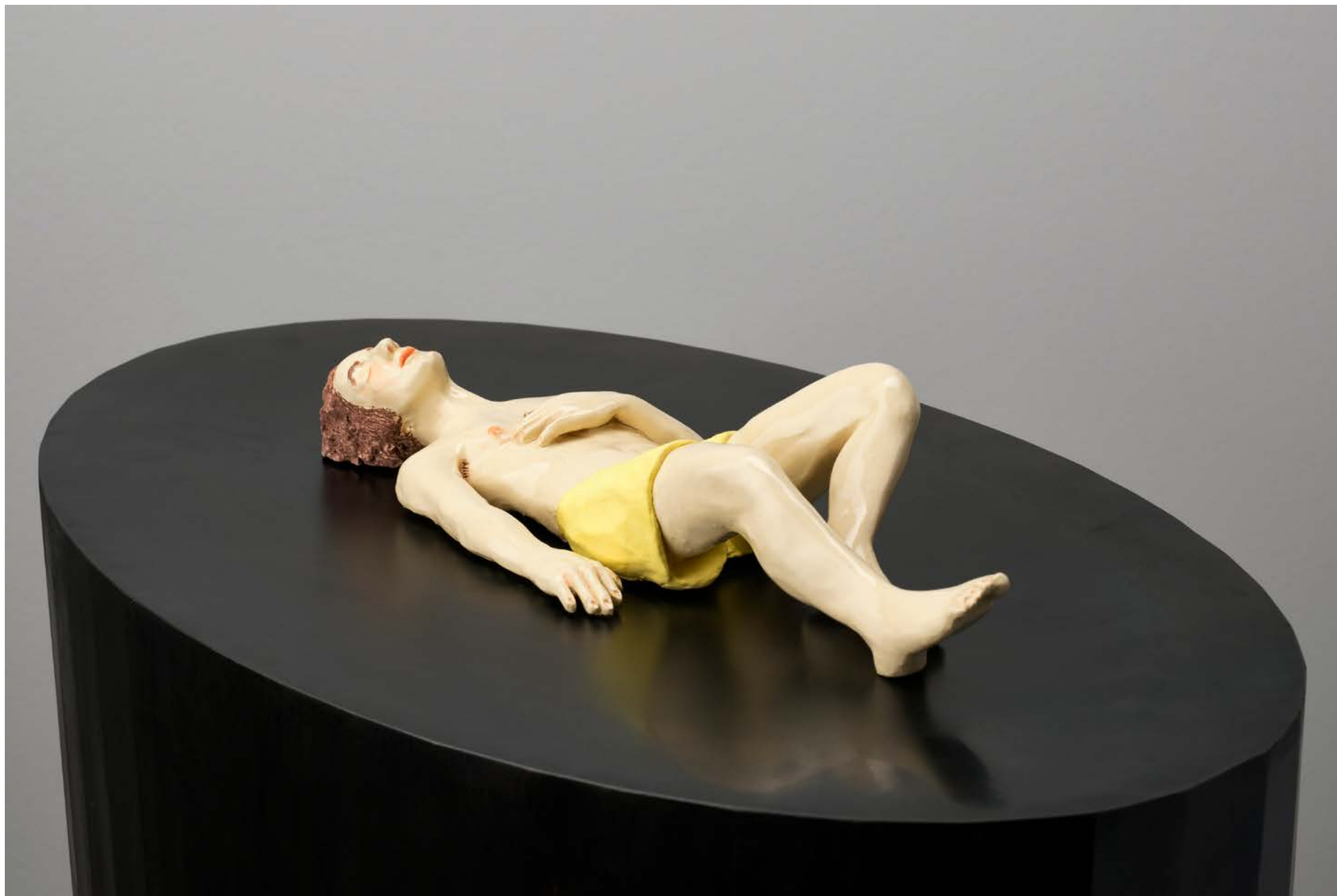
Arthur 2021 ceramics 11,5 x 30,5 x 6,3 cm