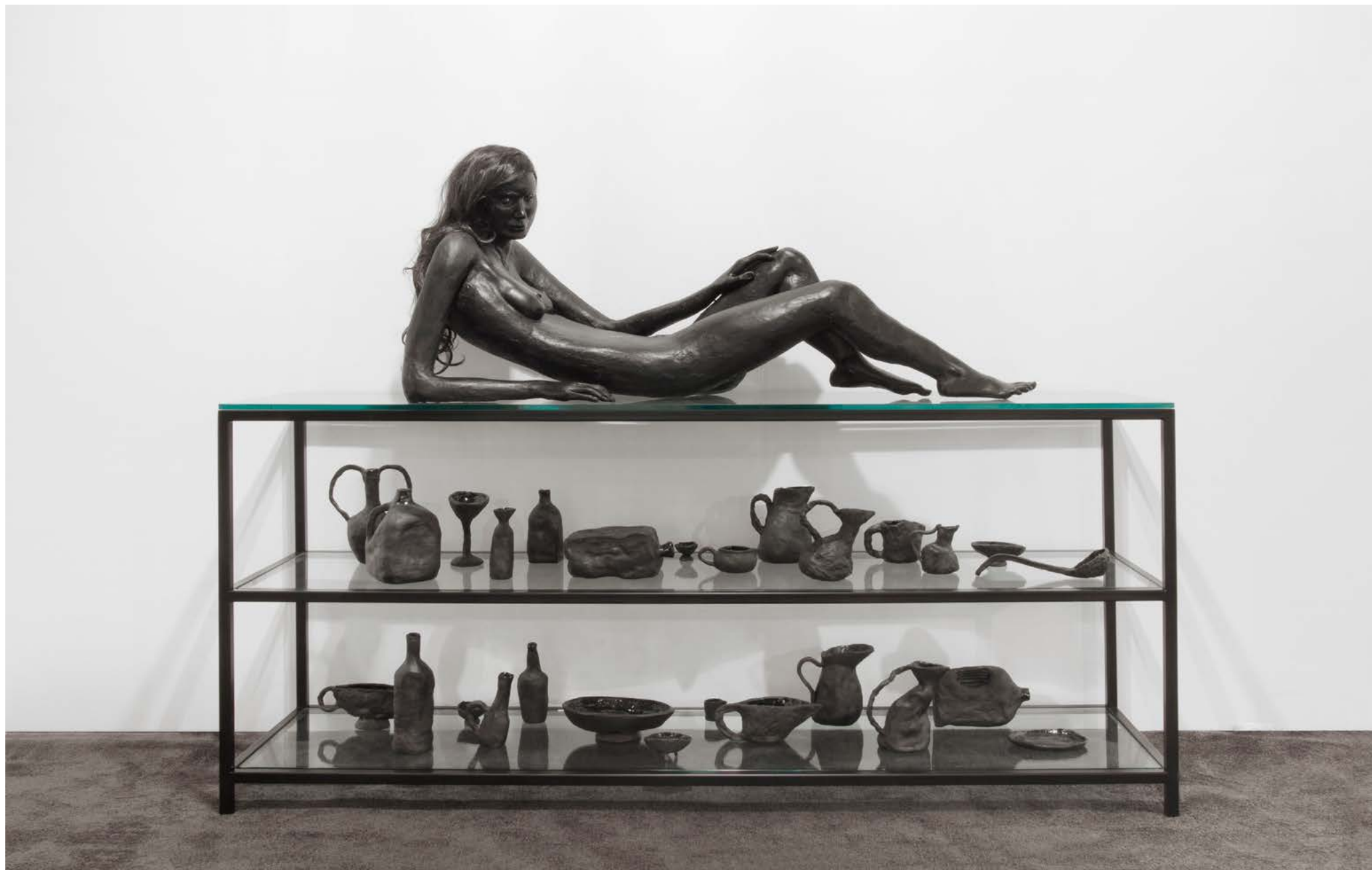
Serving Vessels, 2013, ceramic, hydrocal, steel, glass, synthetic wig