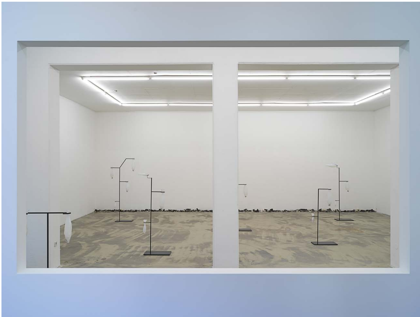
Brine, 2019 exhibition view Klemm's, Berlin