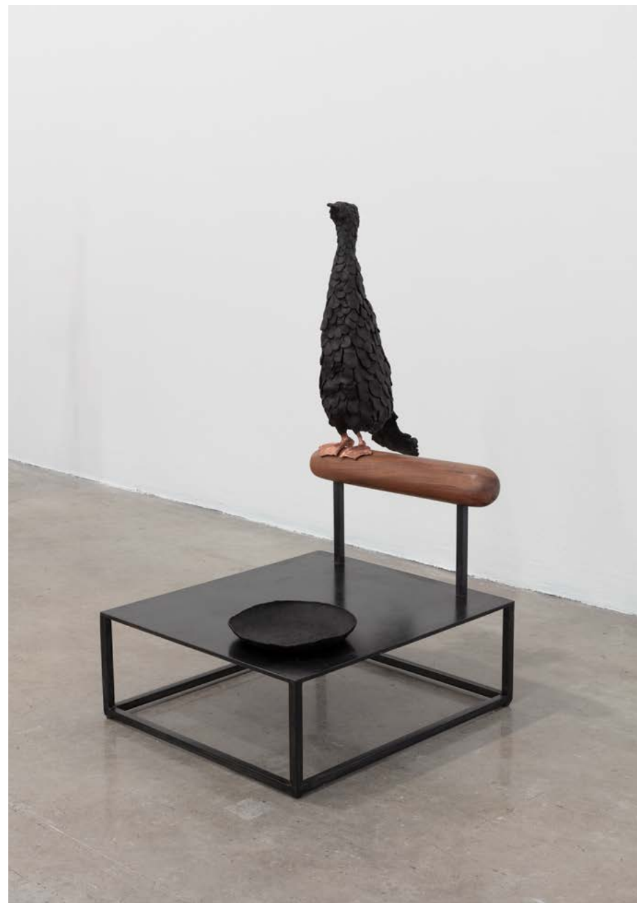
Birds, 2018, ceramic and copper, dimensions variable