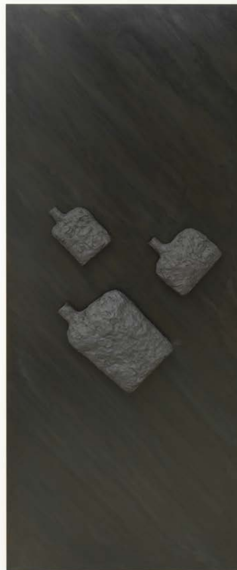
Untitled 6 (Organ Jug Airplane ) 2022 ceramic, blackened steel 160 x 65 x 10 cm