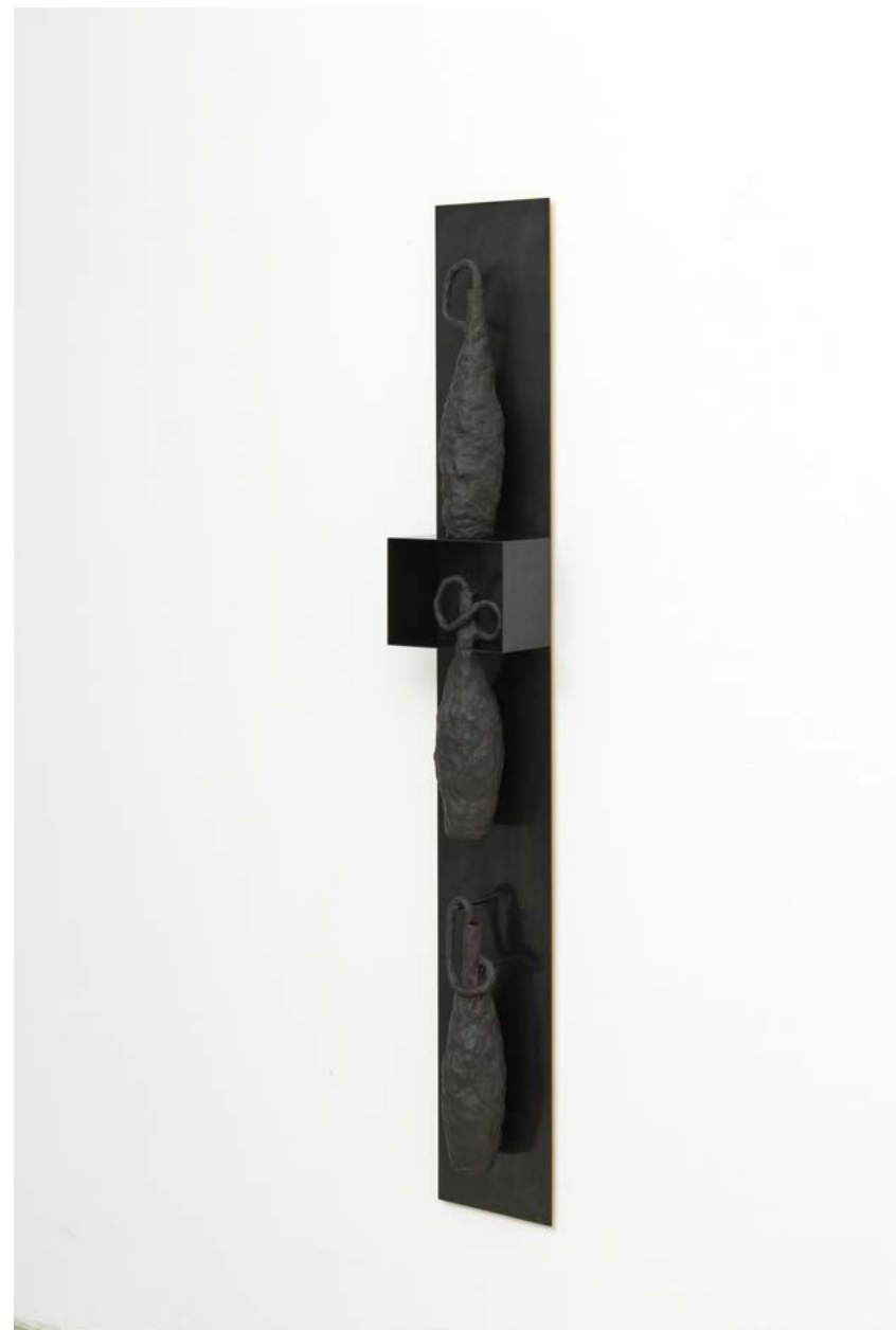
Untitled 2 (this, that, them) 2022 ceramic, blackened steel 160 x 20 x 12 cm