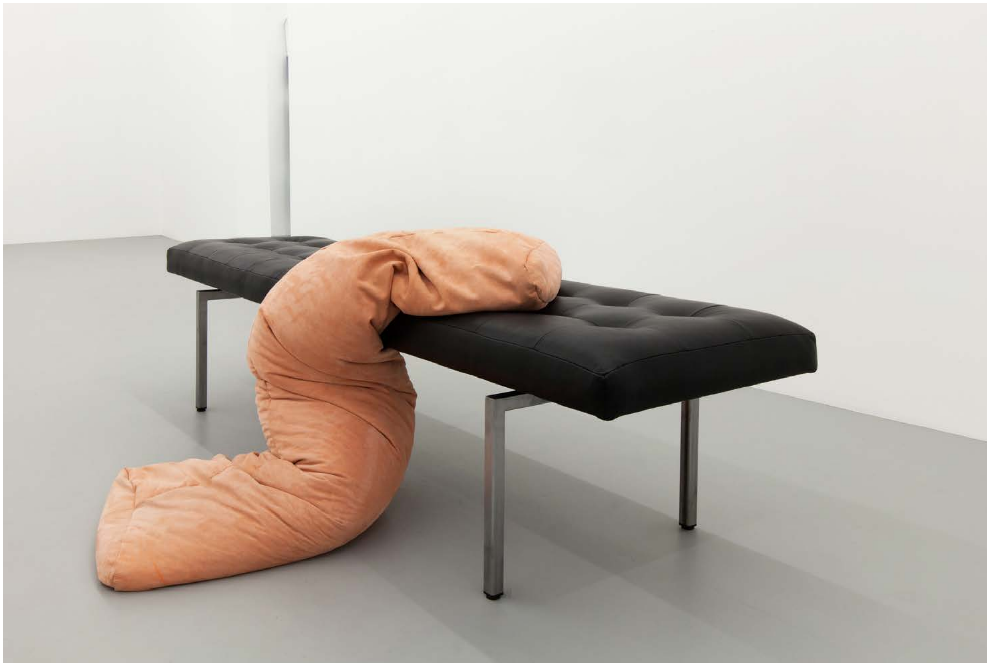
8:30, 2015, hand dyed silk and hand bent aluminum, ceramic and hair, italian sourced leather, peas, foam, steel