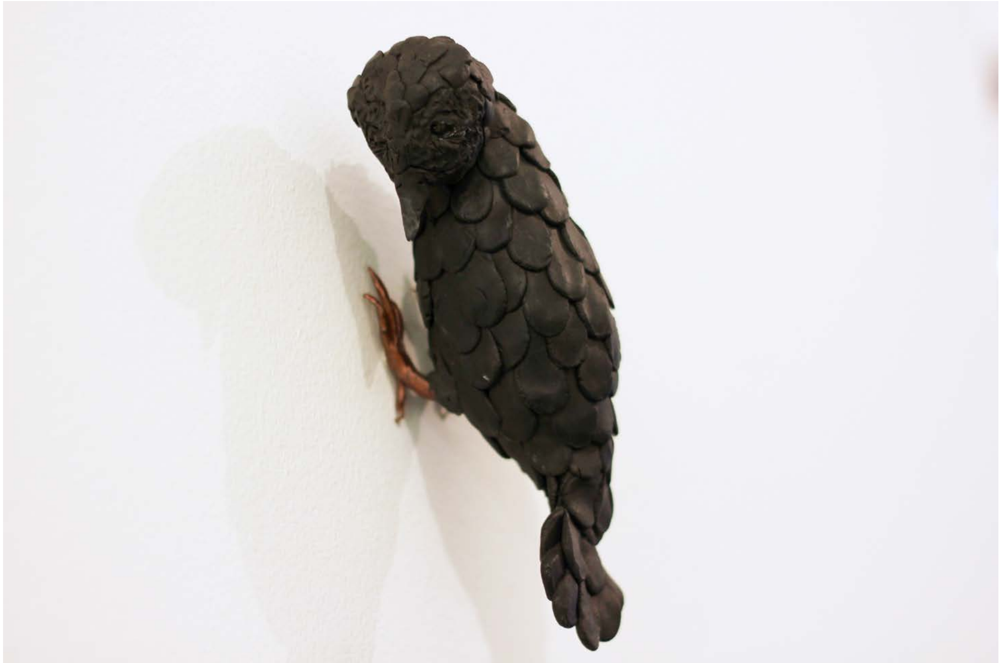
Bird (10), 2018, ceramic and copper, 11 x 19 x 8 cm