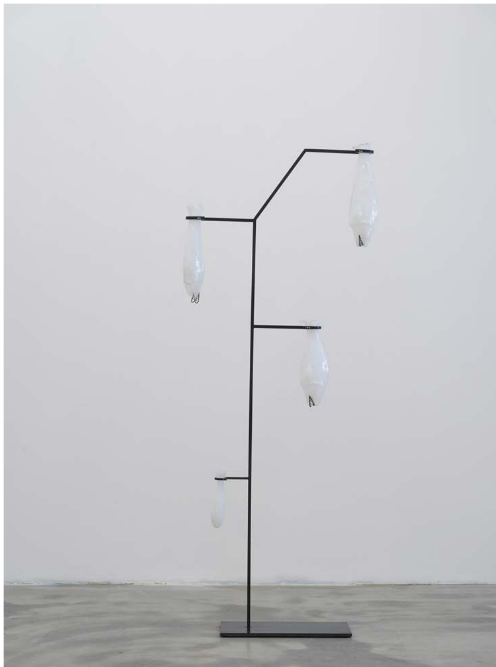
Fish stand with fish,2019, hand-blown glass, copper, blackened steel, 190 x 73 x 22 cm