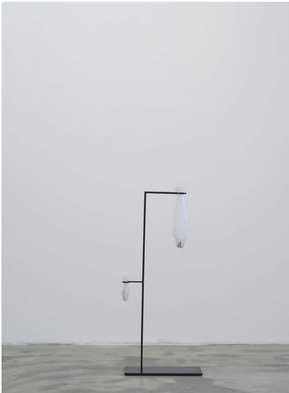
Fish stand with fish,2019, hand-blown glass, copper, blackened steel, 123 x 60