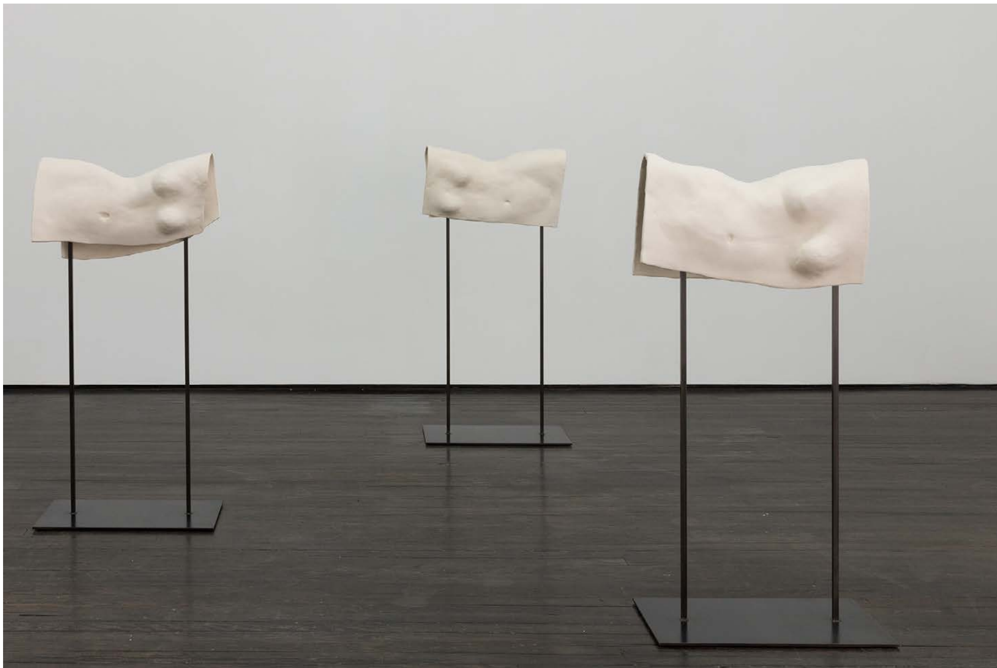
installation view of Pommel (Saddle, Towel, Wrapper, Throw, Sheath, Cloak, Sleeve, Blanket, Carapace, Hull, Pommel, Shell) , 2017, ceramic, blackened steel