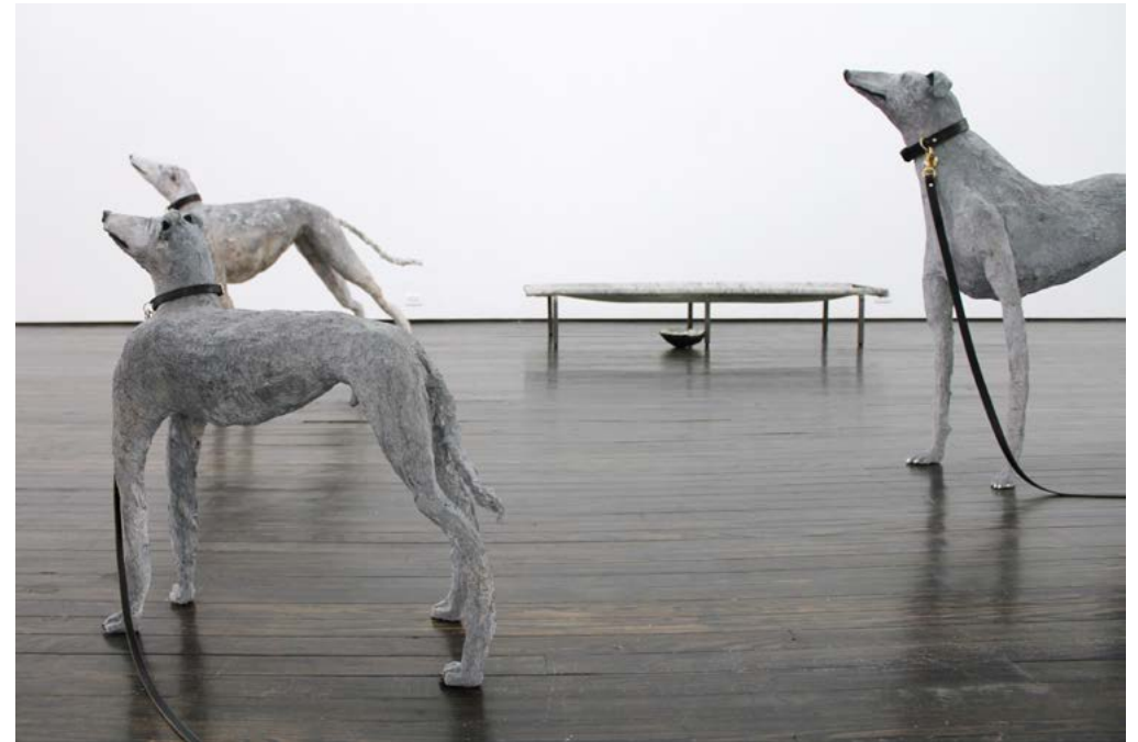
6:30, 2014, Ceramic, plaster, steel, animal hide, granite