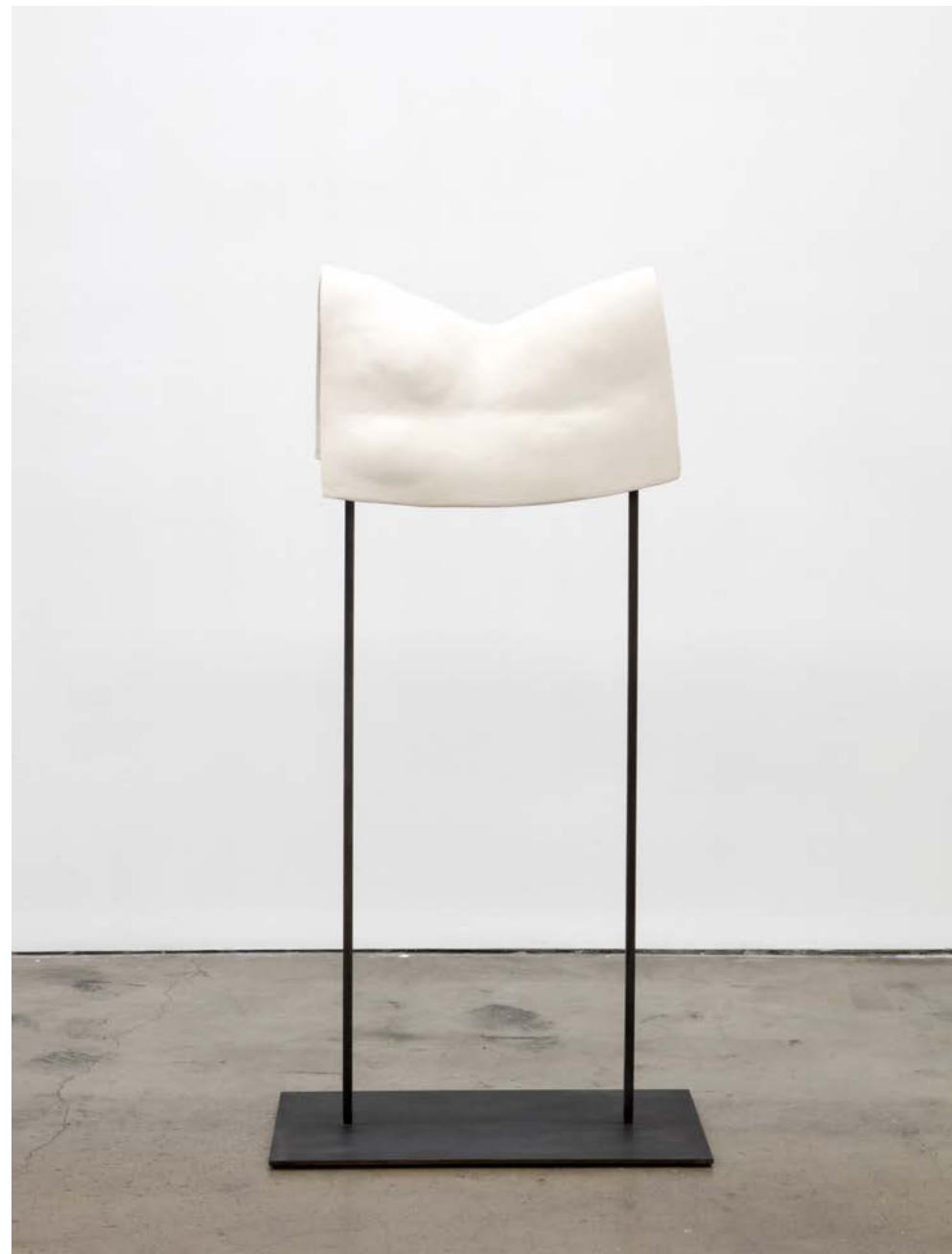
Saddle, 2017, ceramic and blackened steel, 114 x 48 x 20cm