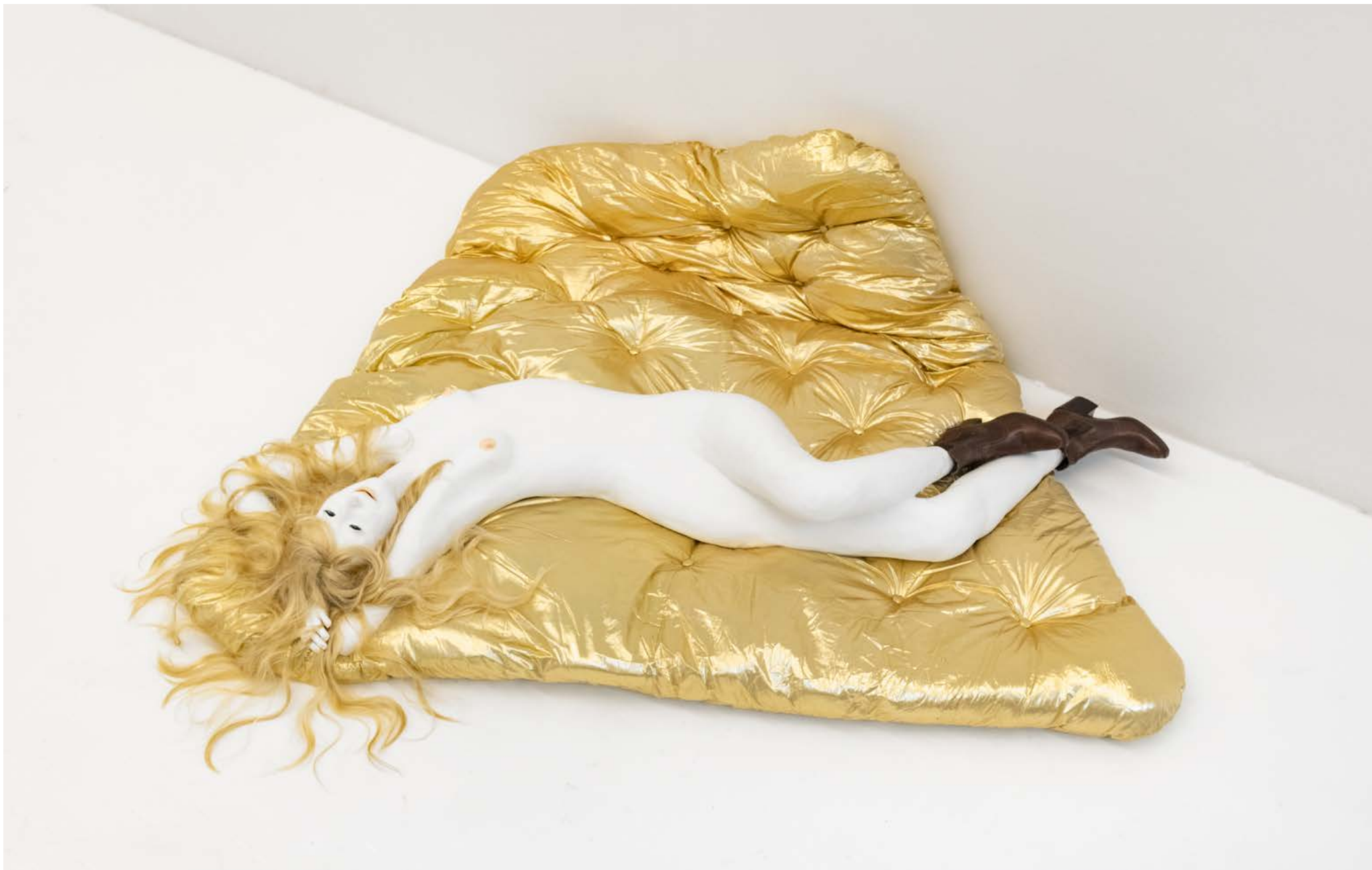
Platinum Musing, 2011, Five free standing sculptres made of hydrocal, ceramic, synthetic wigs, gold lamé, welded steel