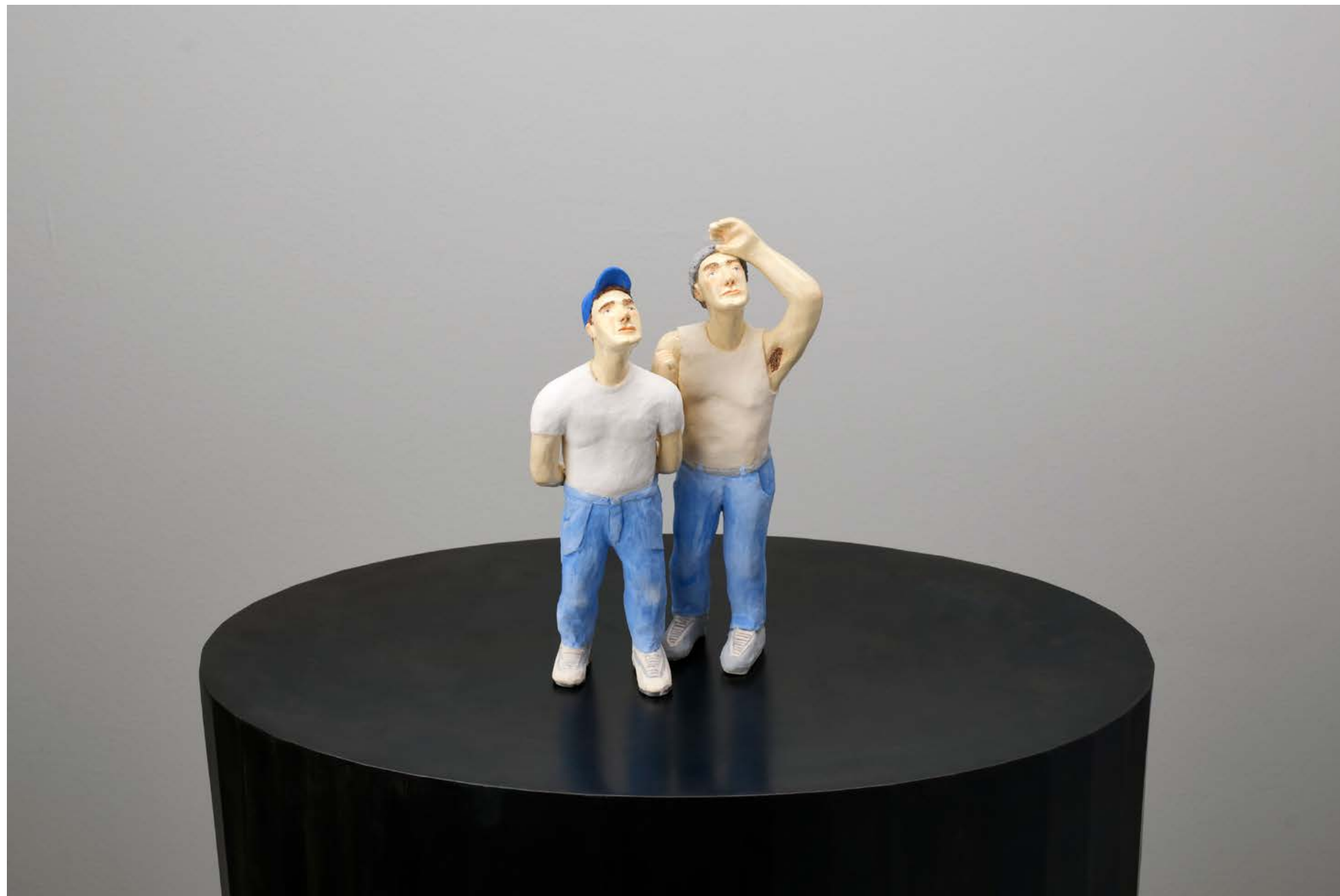
Americans 2021 ceramics 25,4 x 17,78 x 10,2 cm