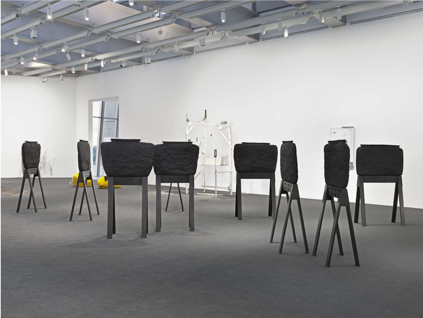
Portrait of a Man (Jack Jaeger), 2016, ceramic, blackened steel, magnetic sand, installation view Whitney Biennale, New York