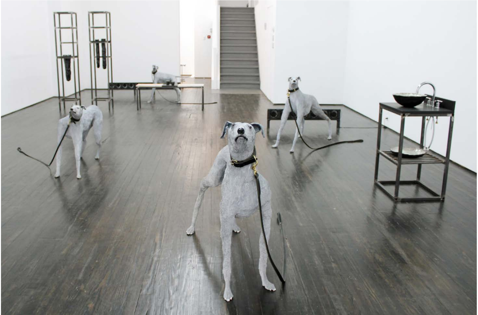
6:30, 2014, Ceramic, plaster, steel, animal hide, granite