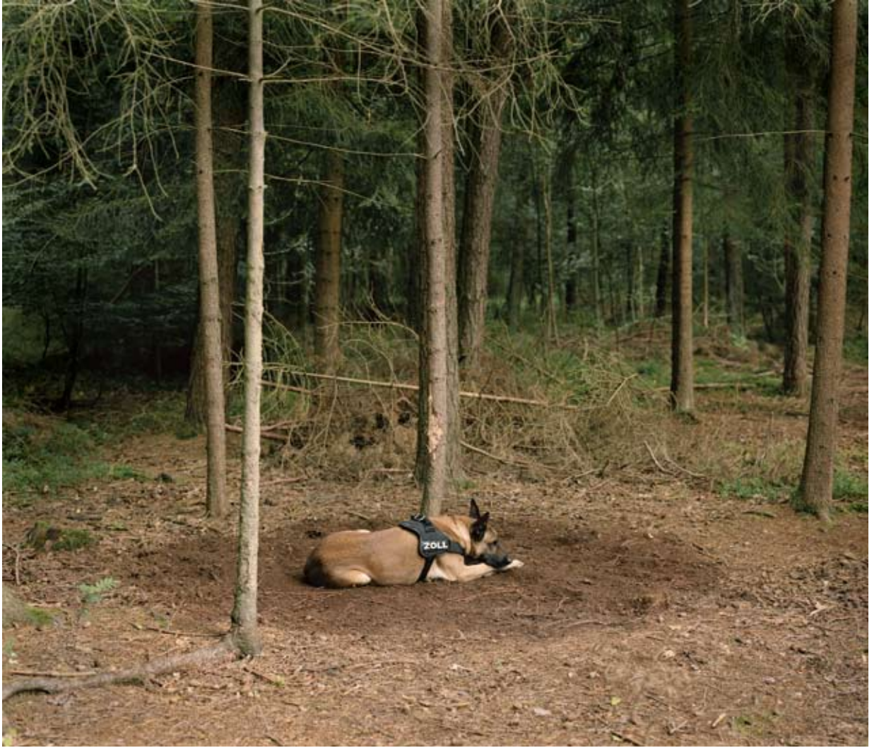
Hinterland 2 (from a series of 5), 2008, c-print, 140 x 175 cm, edition 3 + 1 a.p.