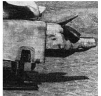
Life among beasts G, 2009, tableau, 3 silver gelatin prints mounted on honeycomb sandwich structure, 91 x 145 cm, ed. 3+1 a.p.