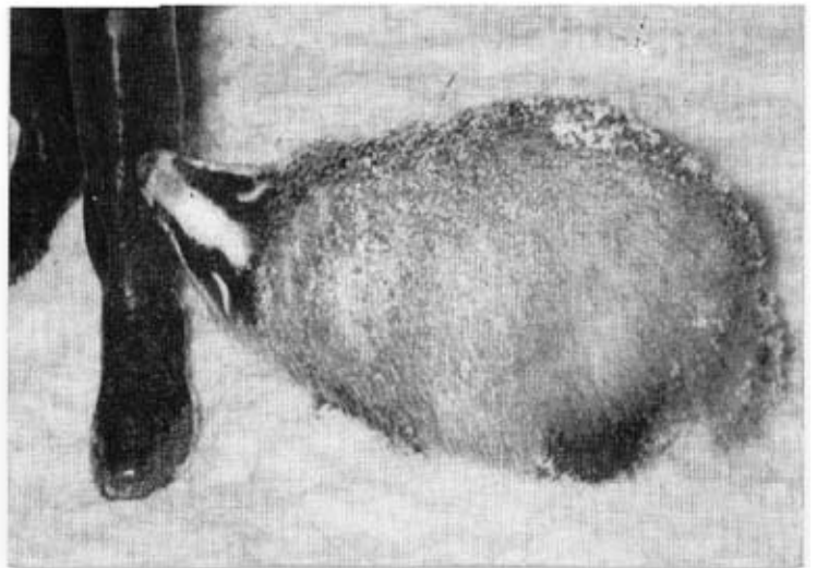
Life among beasts D, 2009, tableau, 2 silver gelatin prints mounted on honeycomb sandwich structure, 92 x 102 cm, ed. 3+1 a.p.