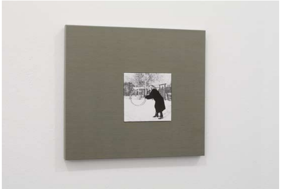
The Negotiated Order (6), 2012, silver gelatin print, linen on mdf, 42 x 43 x 3 cm, edition 3+1 a.p.