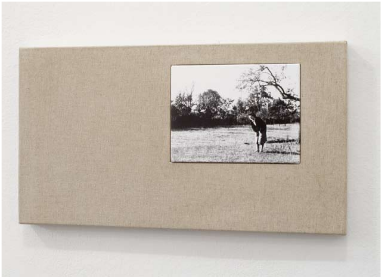
The Negotiated Order (5), 2012, silver gelatin print, linen on mdf, 23,5 x 42 x 3 cm, Edition 3+1 a.p.