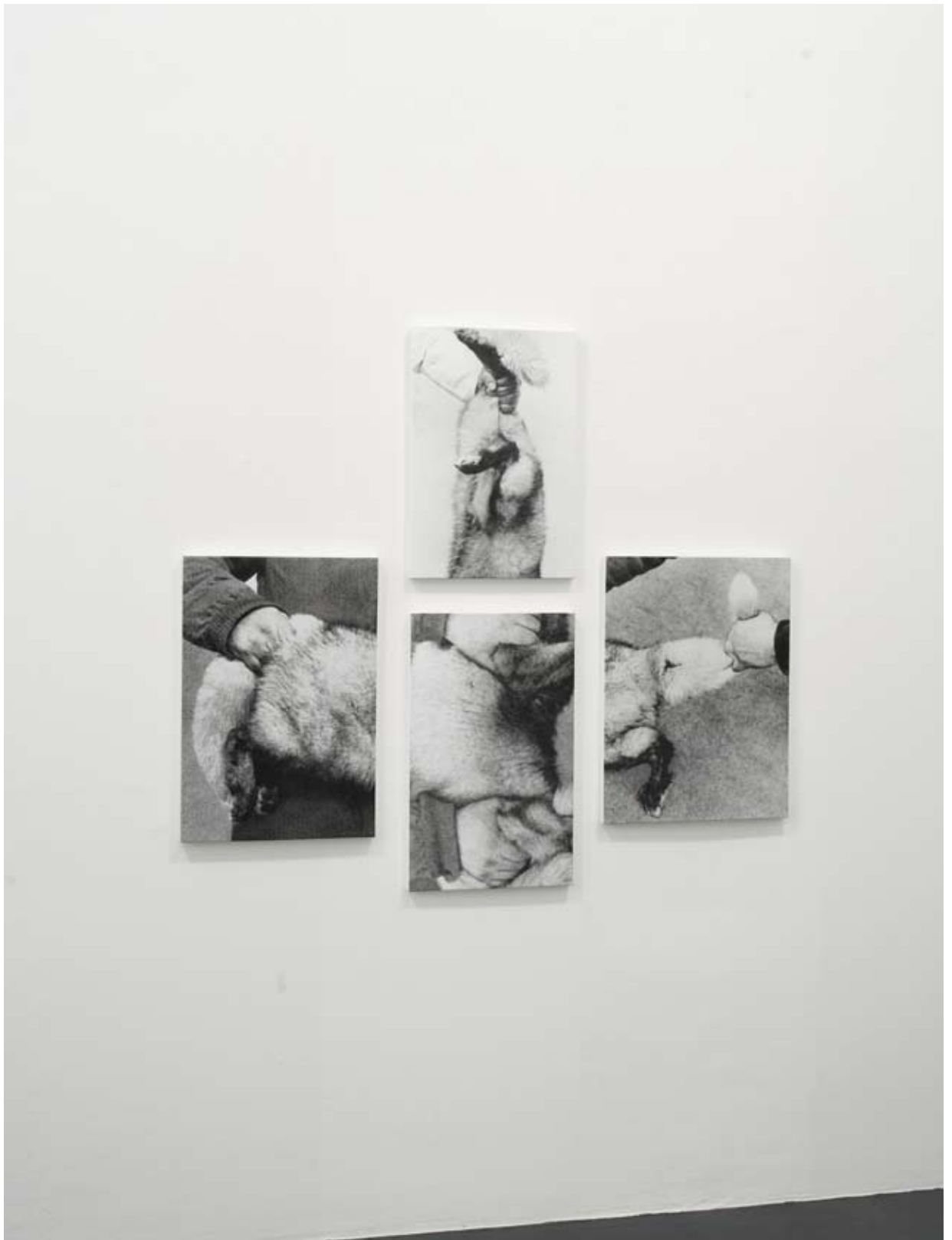
Life among beasts B, 2009, tableau, 4 silver gelatin prints mounted on honeycomb sandwich structure, 165 x 146 cm, edition 3+1 a.p.