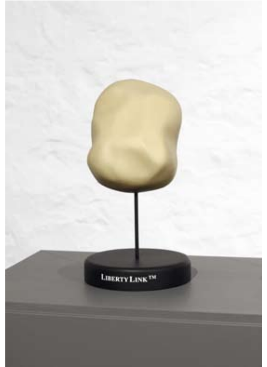
Lab Rats (Liberty Link), 2009