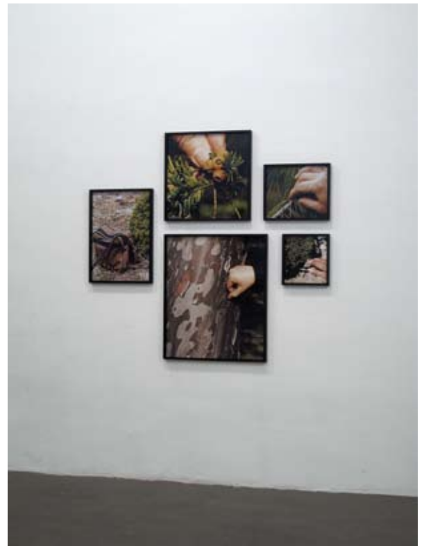
Soft Land (Tableau) 5/2, 2007, 5 c-prints, framed, diverse formats, 150 x 127 cm, edition 3 + 1 a.p.

In the tableaux of his work 'Soft Land' Ulrich Gebert traces the concept of taking up the well-known connection between the act of taking photographs and hunting. He creates a symbolic logic of the images that recalls the clichéd depiction of „hunter and prey“. At the core of all those images lies a visual demonstration of power: nature as the item of research is examined by means of camera and notepad – one collects, draws comparisons and assumptions, scans and classifies. Soft Land takes the peripheral characters to the center in order to group them around an imaginary focus – an implied tree.