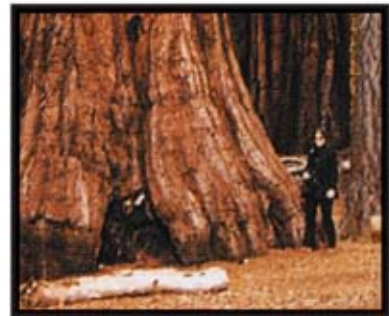
Soft Land #3 (from a series of 5), 2007, 5 c-prints, framed, diverse formats, 150 x 127 cm, edition 3 + 1 a.p.