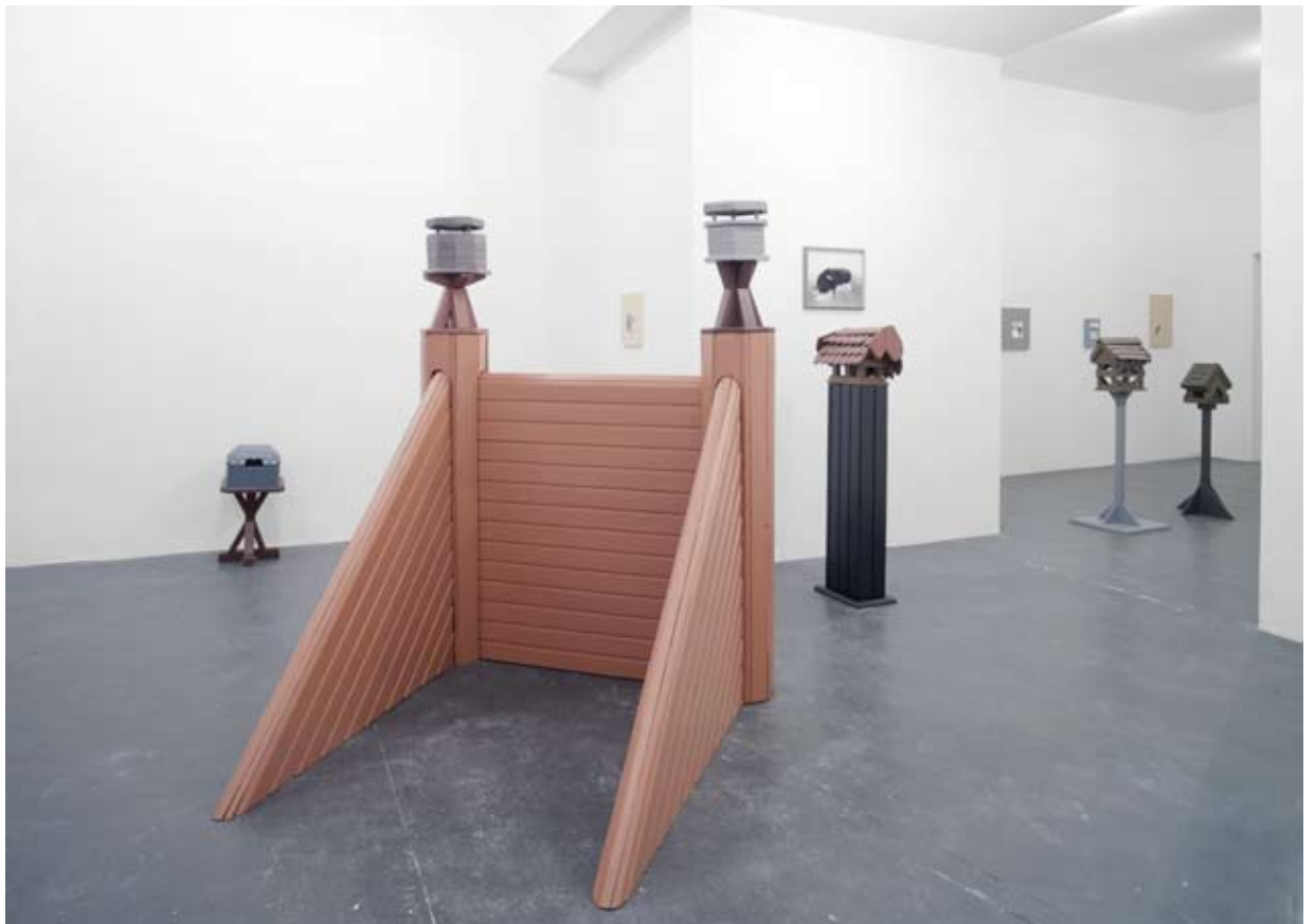
A Breed Apart, exhibition view Klemm's, Berlin 2012