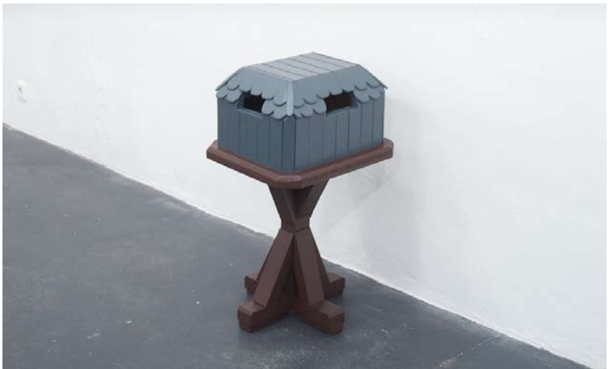
Your Obedient Servant (1), 2012, modified object, wood, lacquer, 72,5 x 34 x 42,5 cm