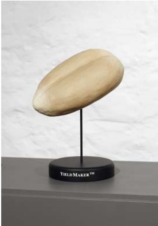
Lab Rats (Yield Maker), 2009