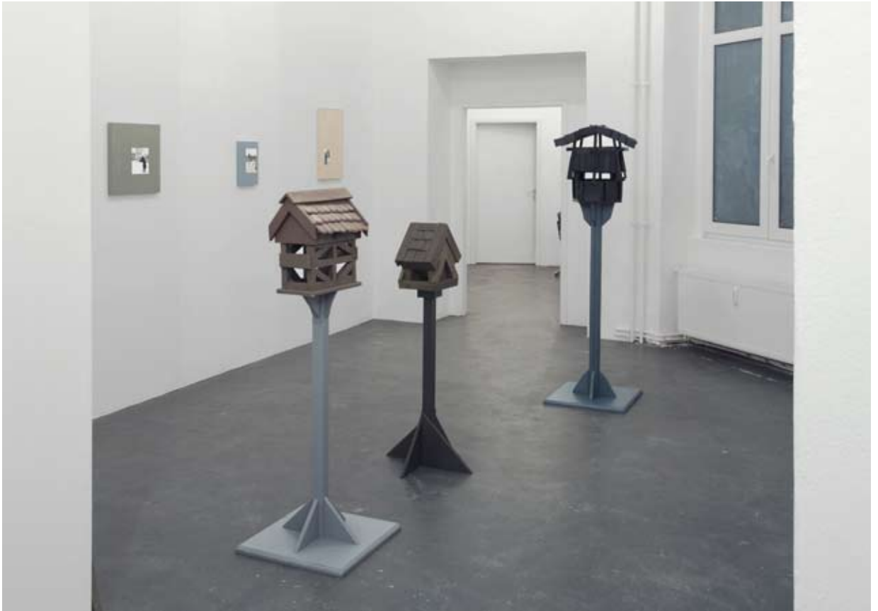
Your Obedient Servant (2-6), 2012, modified objects, wood, lacquer, various sizes