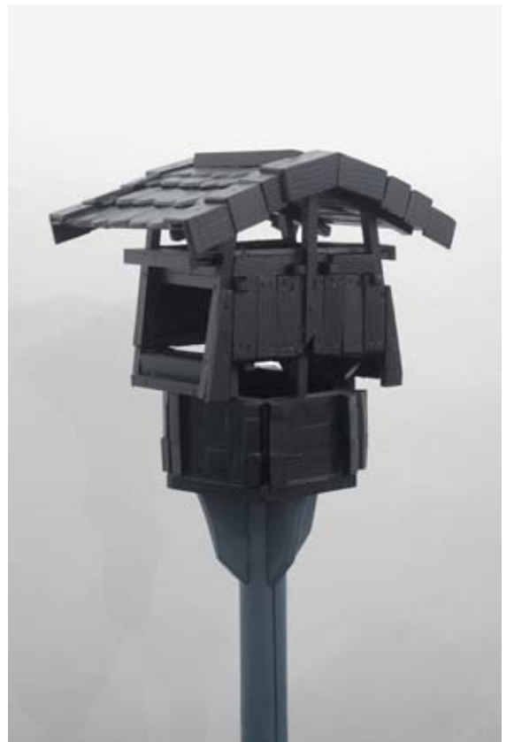
Your Obedient Servant (6), 2012, detail