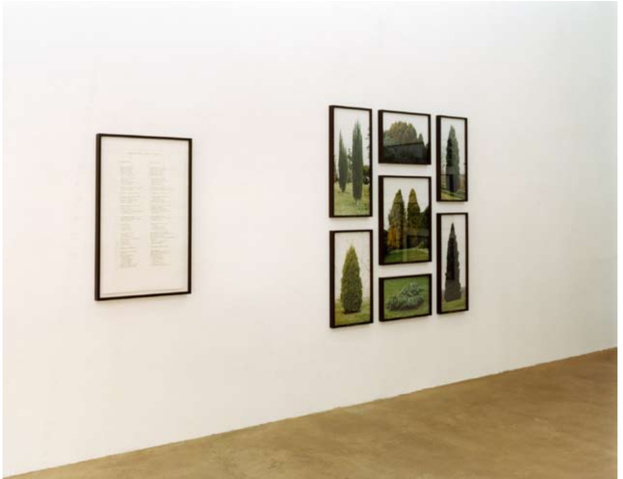
Typus Tableau #10, Tableau #1 (index), 2005

Ulrich Gebert is interested in principles of ordering: what do they mean, what are the consequential problems of ordering systems? His apparent subject here is conifers, and his huge panels each comprising six or seven prints of trees taken in botanical gardens have stunning impact on the most simplistic level: they are glorious pictures of trees. Yet the panels, seeming to present an orderly progression of species, are set next to a „List of Invalid Names“ reflecting the morphological upheaval that is a constant of the botanical world. Gebert sees racism as one of the ultimate consequences of typology and sees this series as a critique of all typological thinking. The elegant irony is that as he criticizes typology in the art world he is also complying with its requirements.