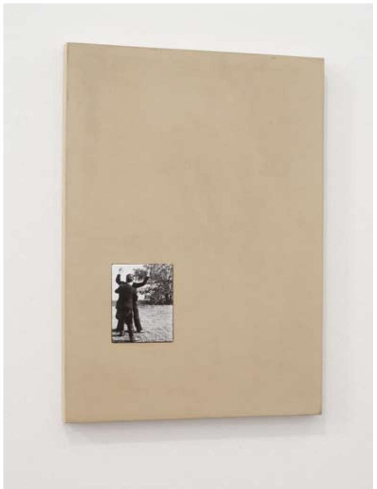
The Negotiated Order (8), 2012, silver gelatin print, linen on mdf, 58 x 38 x 3 cm, edition 3+1 a.p. Edition 3+1 a.p.