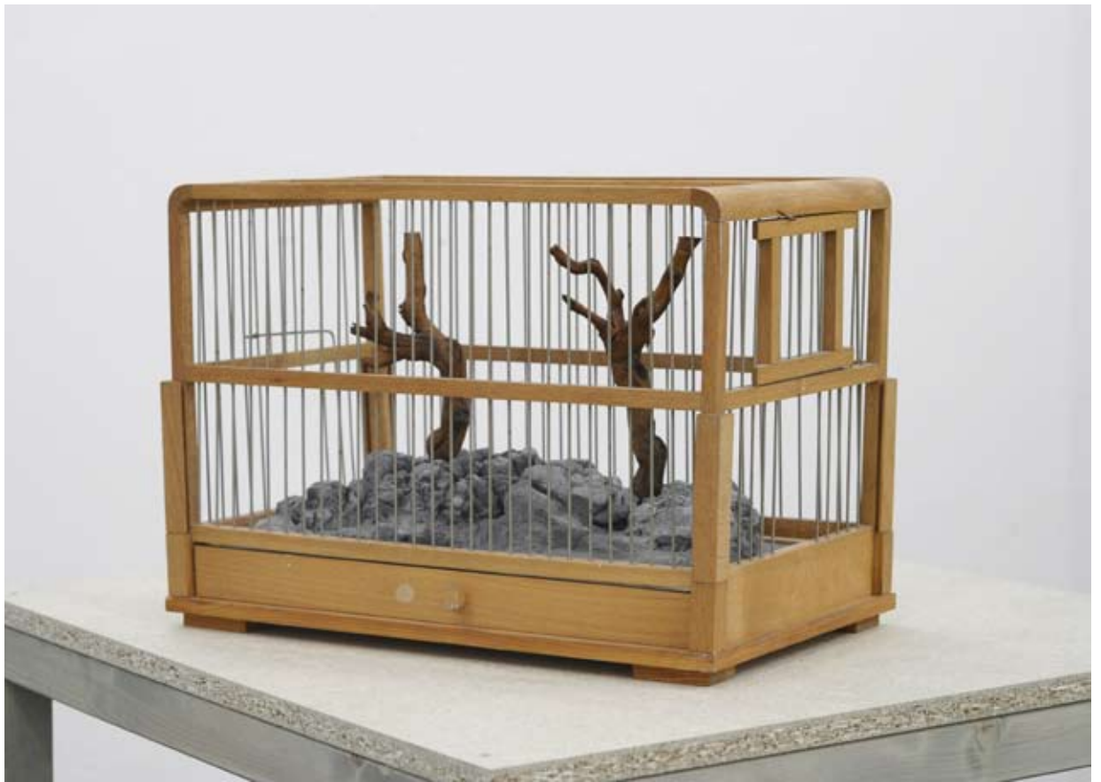
Beastly Buildings #4, 2009, modified cage, plaster, paint, wood, 27 x 35 x 21 cm