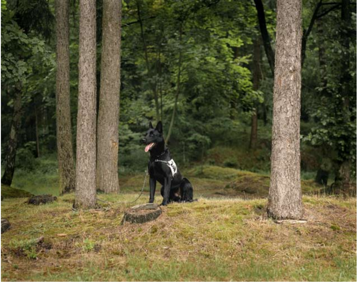
Hinterland 5 (from a series of 5), 2008, c-print, 140 x 175 cm, edition 3 + 1 a.p.