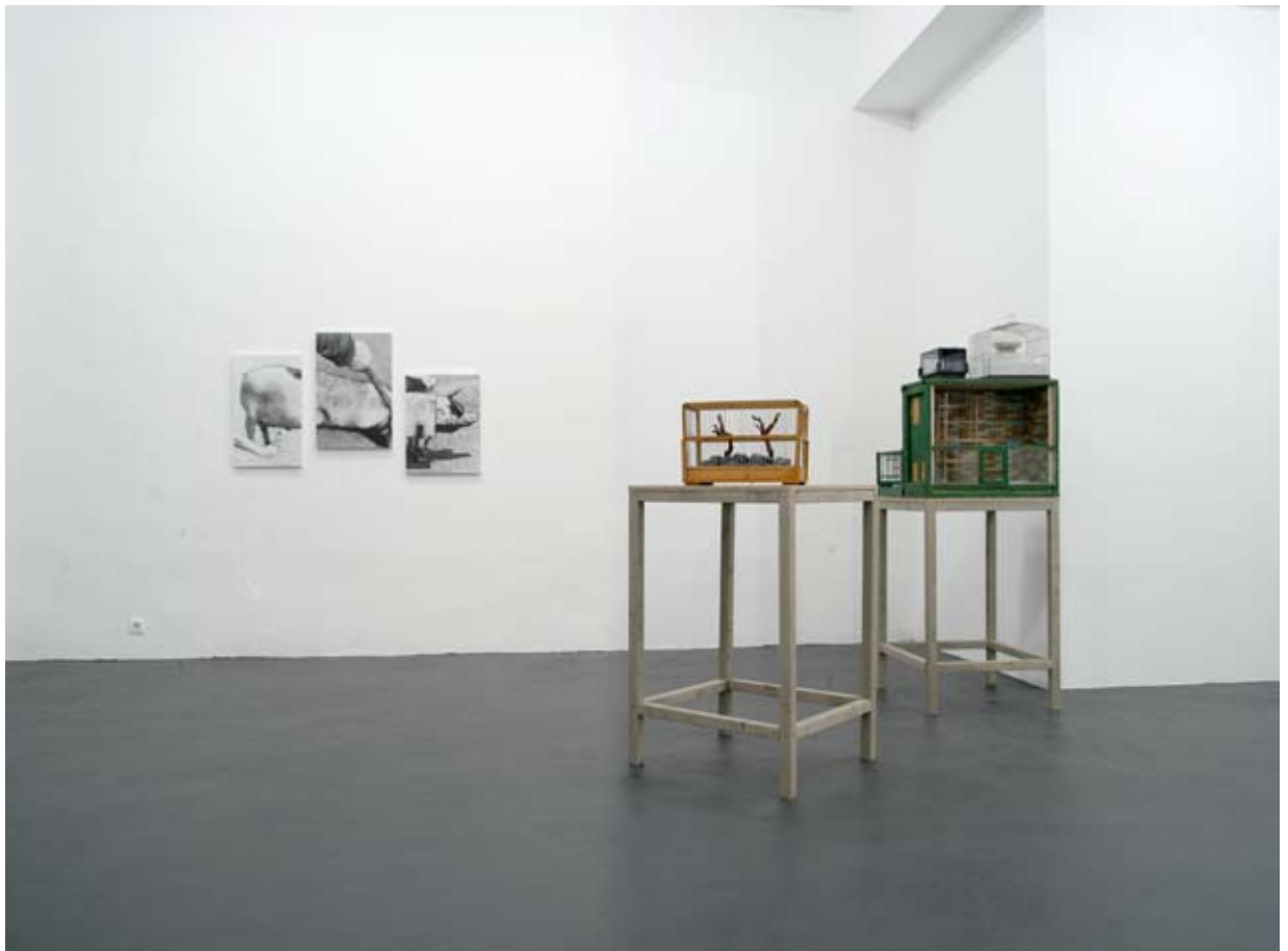
Life among Beasts, 2009, exhibition view KLEMM'S, Berlin

„All aspects of the relationship between human mankind and nature solidify behind the bars of an animal cage: repulsion and fascination, the will for appropriation, control and knowledge, the gradual acknowledgement of the complexity and idiosyncrasy of different life forms and much more. The microcosm of the zoo herewith stands in close relation to the history of other modern phenomena such as colonization, ethnocentrism and the discovery of the Other, the civilization of men, the development of cultural and commemoration sites like museums, or the development of leisure time. The gaze at the animal cage hence allows us to comprehend an entire society.” E. Baratay und E. Hardouin-Fugier: Zoo - Von der Menagerie zum Tierpark, Wagenbach, Berlin 2000; (translated by KLEMM'S, 2009)