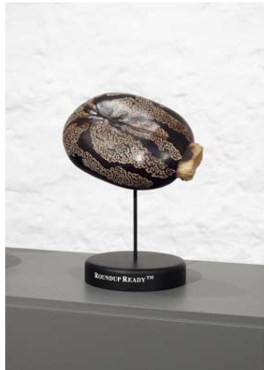
Lab Rats (Roundup Ready), 2009