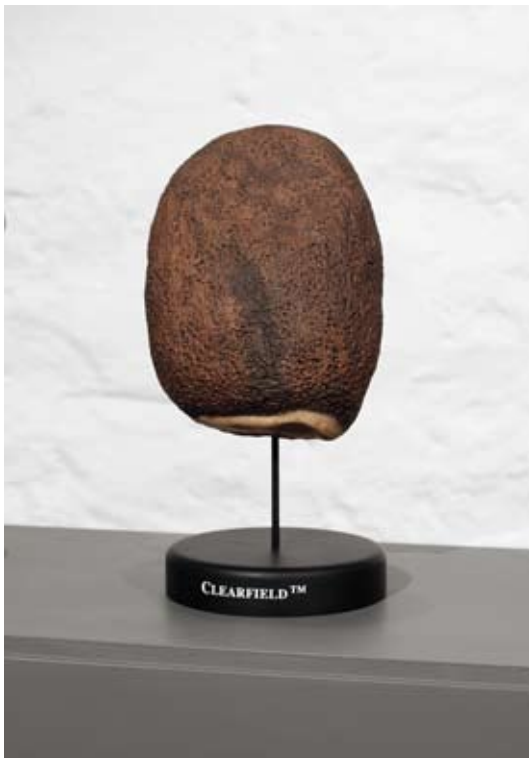
Lab Rats (Clearfield), 2009