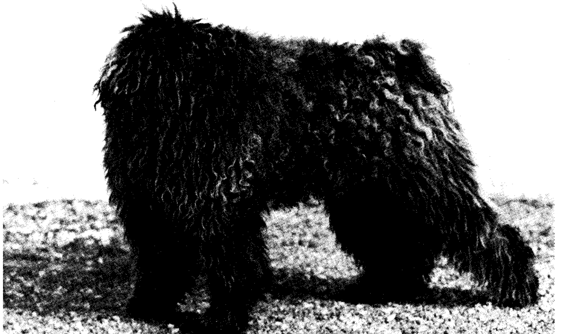
Dr. Kobers Sorge um die Zuchtwahl (3), 2010, gelatin silver print mounted on aluminum construction, 41 x 57 cm, edition 3+1 a.p.