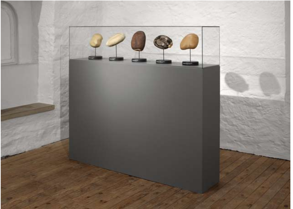
Lab Rats, 2009, mixed media, 145 x 160 x 35 cm, exhibition view ‚Trophäenzimmer‘ Kunstverein Hildesheim