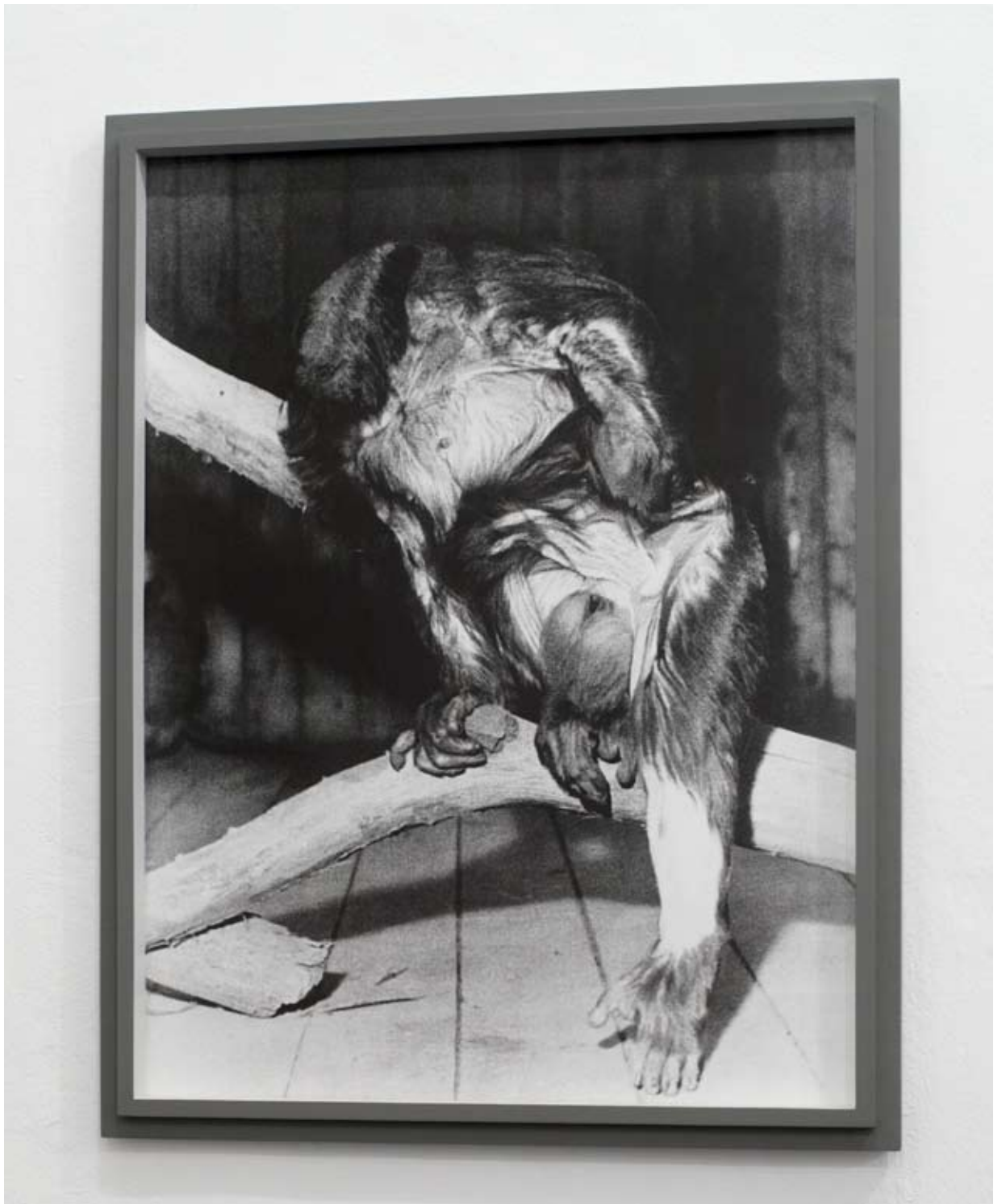
A Breed Apart (1), 2012, silver gelatin print, dibond, 87 x 68 x 3,5 cm (artist frame), edition 3+1 a.p.