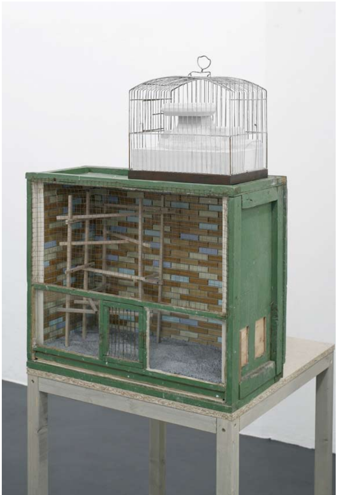
below: Beastly Buildings #2, 2009, modified cage, ceramics, wood, paint, 70 x 35 x 27 cm above: Beastly Buildings #3, 2009, modified cage, plaster, 25 x 28 x 17 cm