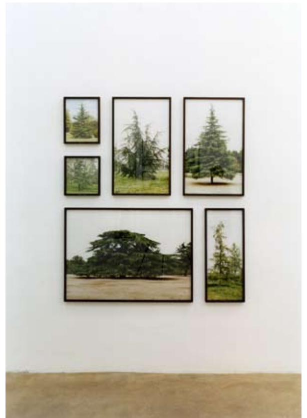
Typus, 2005, 9 Tableaux each 170 x 150 cm, different c-prints, framed and with taxonomic plates, edition 3 + 1 a.p.