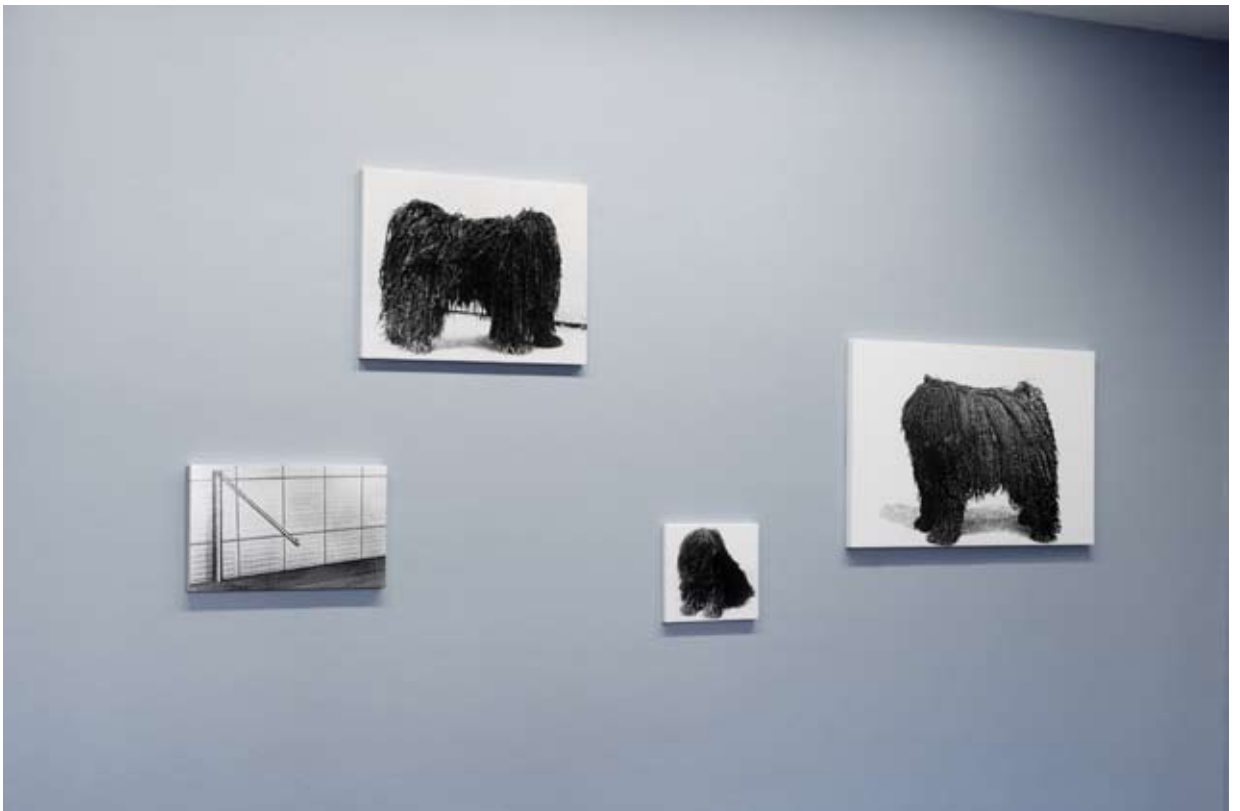
Dr. Kobers Sorge um die Zuchtwahl 2010/2011; installation view ‚Über die Metapher des Wachstums‘, Frankfurter Kunstverein 2011