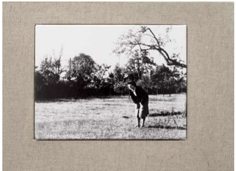
The Negotiated Order (5), 2012, detail