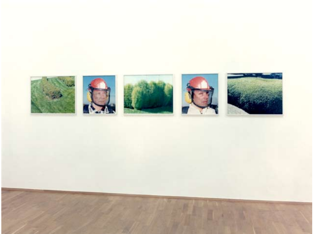
Freischneider, 2004, 3 c-prints 55 x 70 cm and 2 c-prints 55 x 50 cm, edition 3 + 1 a.p.